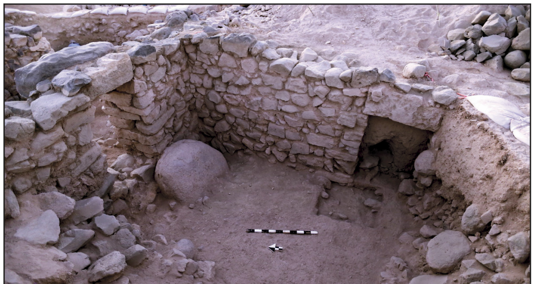
Area H House at Balu'a.