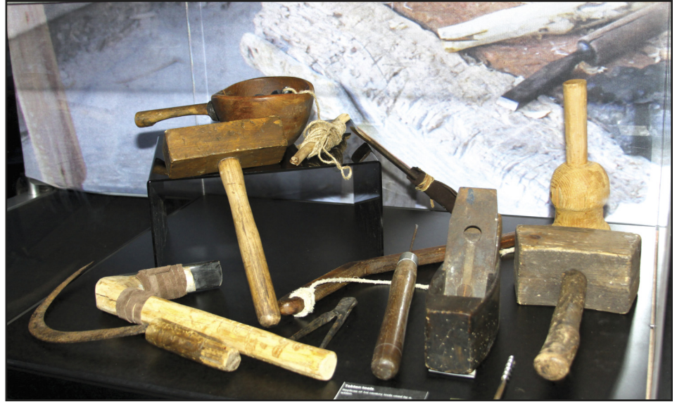
World of Jesus Exhibit Display.