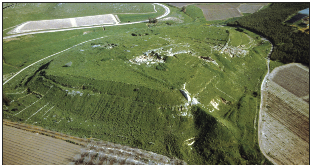
Lachish.