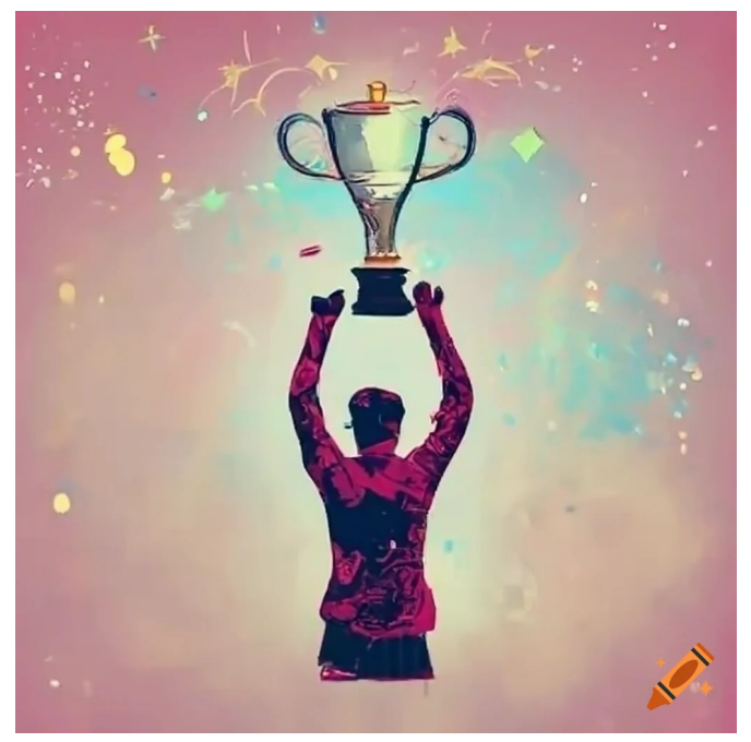
Al generated image created with www.craiyon.com