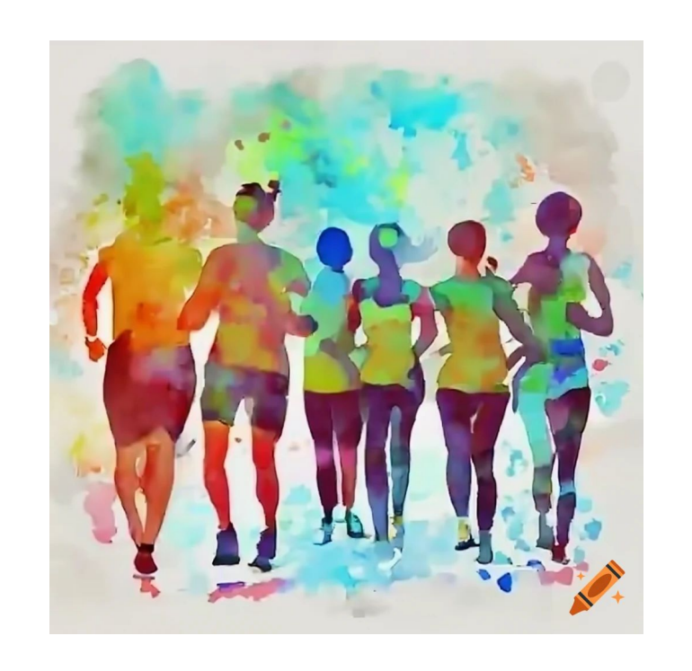
Al generated image created with www.craiyon.com