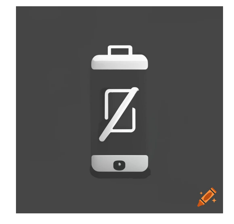
Al generated image created with www.craiyon.com