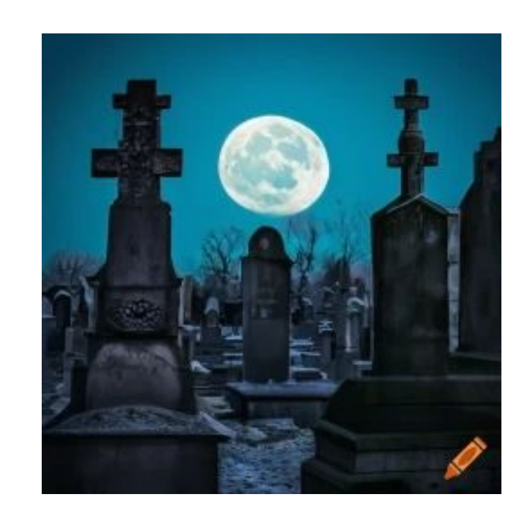
Al generated image created with www.craiyon.com

There is a 20-30% increased risk of death among persons who are not physically active.<sup>1</sup>