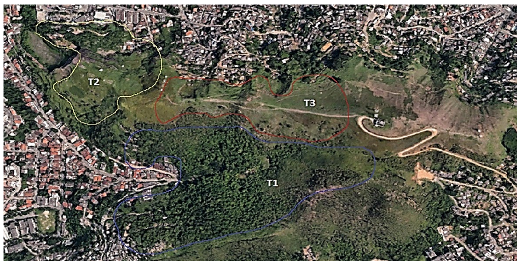
Figure 1. Aerial view of the study site located in the Conservation Unit Parque Natural Municipal da Água Escondida, in Morro da Boa Vista, Niterói, RJ, Brazil.

In the study area there are three different soil cover compositions, called treatments(T), being: T1. lands with established forests; T2. reforested lands; T3. open land, where soil samples were later collected (Fig. 1).