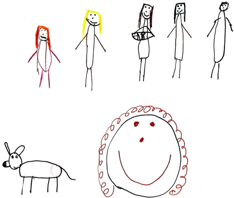
Fig. 1 I care about animals, and I run away from arguments

family group. They also often brought photos of cats and dogs in the photo-voice activities, framing them as part of their relational support network: