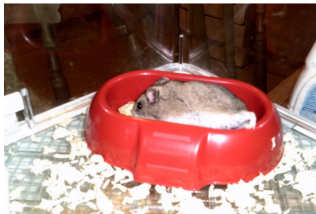
Fig. 2 a Ginger, the hamster