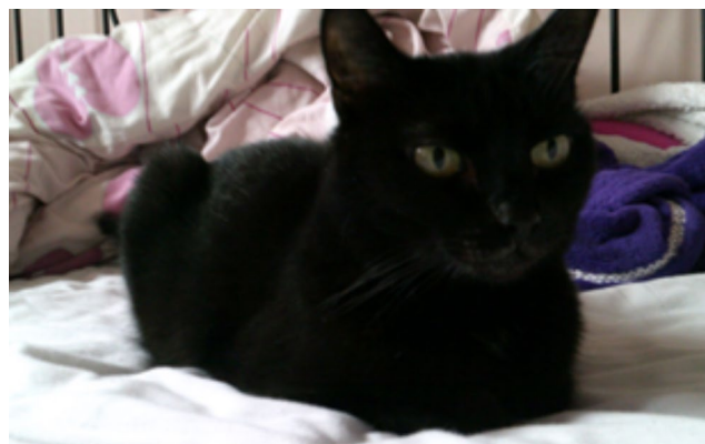
Fig. 3 "My cat always seems to be there and sits with me. At night, I sometimes get nightmares, but when she's in my room, I don't."