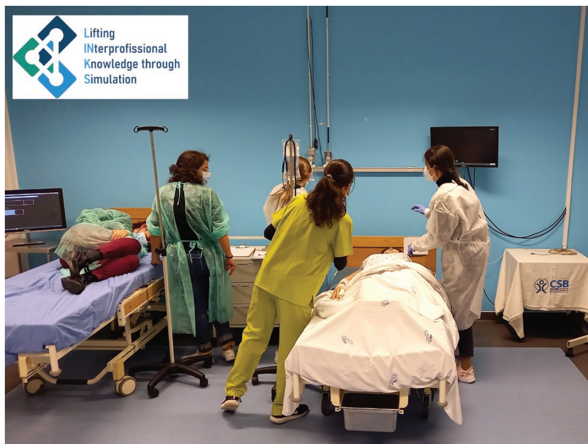
Figure 2: Illustrative image of a simulation scenario (multi-patient setting) during one session of the workshop.

experience, previous participation in an IP educational context and the ability to read and understand English at a level that would allow to complete questionnaires in that language. The student's proficiency in English was considered an inclusion criterion.