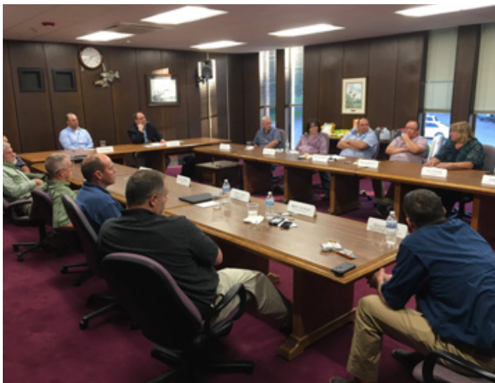
Second night of stakeholder focus group meetings

Eighteen of the 21 stakeholders (86%) who accepted TWRA's invitation actually attended the focus group meeting (Table 1).