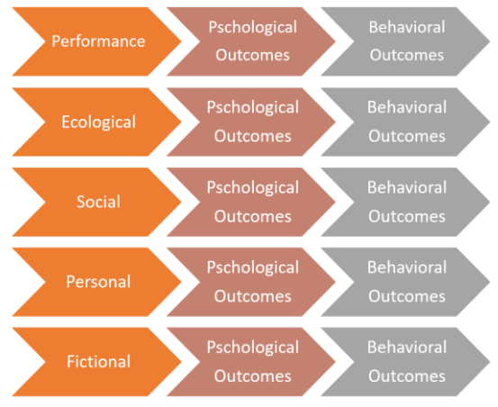
Figure 1: Affordances of gamification types

The resulting framework adopted for this study is presented in Figure 1. The framework comprises two dimensions. The first dimension presented in the horizontal axis stands for the affordances that induce psychological and behavioral outcomes. In the vertical axis, affordances and their effects are grouped into gamification types. Accordingly, affordances that belong to different gamification types may induce different types of psychological and behavioral outcomes.