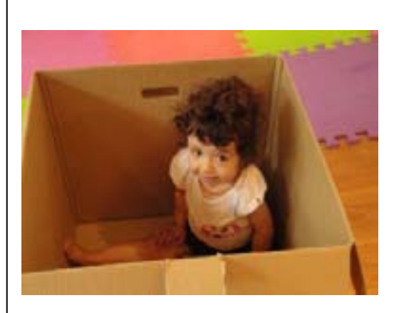
Topic (2) Making Choices and Making decisions Your views about how people treat you? About whether you can make choices and decisions? How this makes you feel?