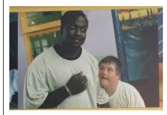
Topic (3) Growing up and being more independent What would like to do in the future? What help you would like to have?