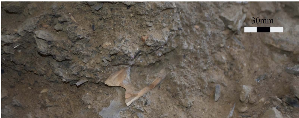
Figure 5. Bone fragments collected in Şikefta Elobrahimo Cave and photographed in the field (figure by E. Kodaş).