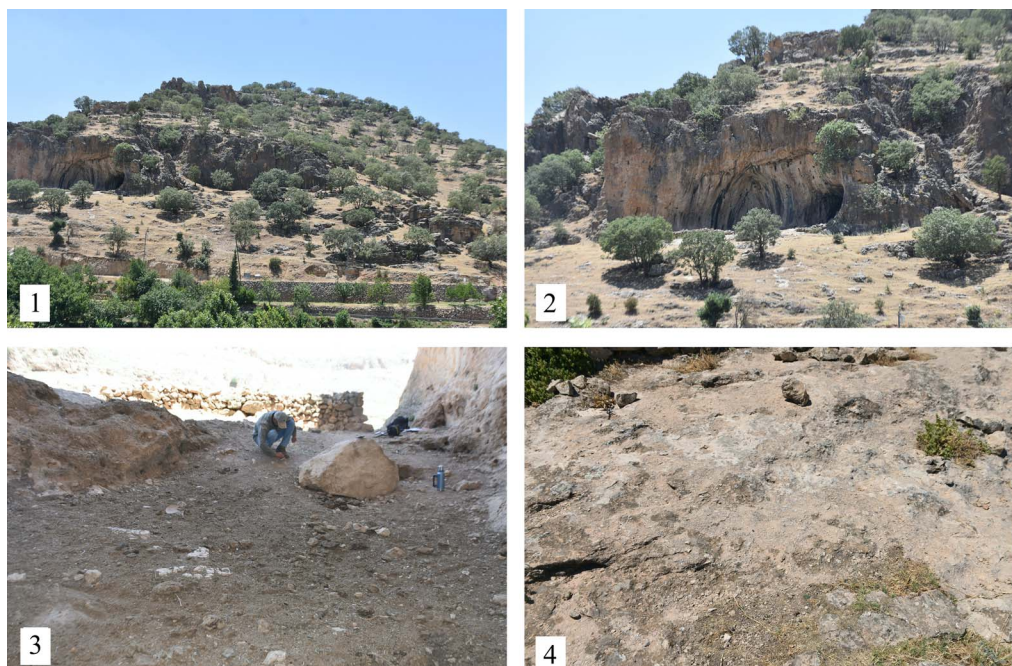
Figure 1. General view of Şikefta Elobrahimio Cave (1–2), chipped stone products on the cave floor (3–4) (figures by E. Kodaş).

each cave and rock shelter based on a preliminary reconnaissance from maps, the systematic exploration of tracks in a vehicle, and the intensive on-foot collection of lithic tools. The Ğurs Valley runs from the plain of Kızıltepe to the Mazı Mountain range, starting at the 600m isohyet, and is deeply cut by the Zergan River, which joins the Khabur River north of the Djebel al-Aziz Range in northern Syria. It is described primarily as a Cretaceous–Palaeocene formation (Karadoğan & Coşkunsu 2013). A detailed study of the geological context of the cave will be undertaken ahead of archaeological excavation by the geologist from our team, combined with photogrammetric studies.