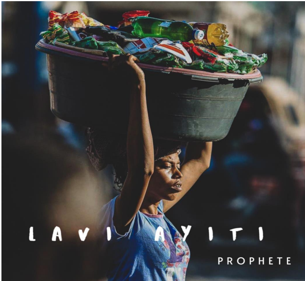
Figure 4. Artwork for single Lavi Ayiti releasing on May 29 th .