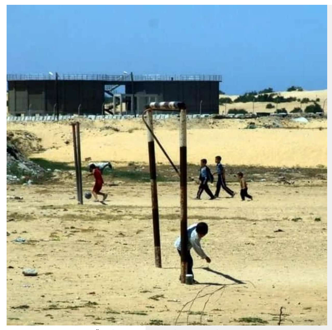
"Wadi Gaza 2010"

This might be my last email to you [... while] we [with my wife and my five kids] have been deprived completely from water, electricity and food [...]. Please [...] do whatever you can to stop the genocide [...] [we] may not be the same colour as [you] but [we] are not 'human animals'.