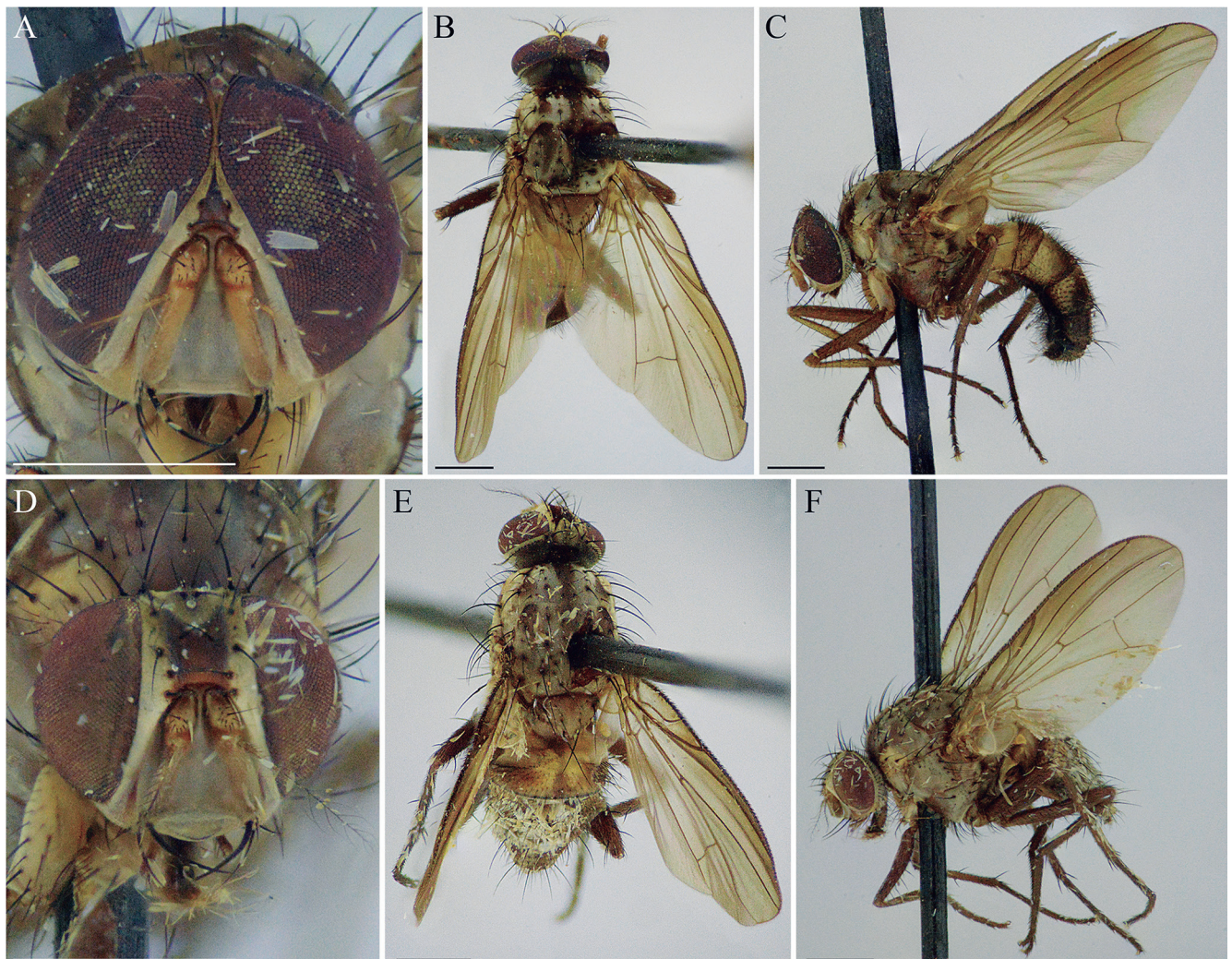
Figure 1. Phaonantho benevola Couri, 1979. Male: (A) Head, frontal view. (B) Habitus, dorsal view. (C) Habitus, lateral view. Female: (D) Head, frontal view. (E) Habitus, dorsal view. (F) Habitus, lateral view. Scale bar: 1.0 mm.

Remarks: Phaonantho devia Albuquerque is a junior synonym of Phaonantho mallochi (Couri, 1979). Some specimens were collected with Malaise traps, light traps, and Shannon traps, using garbage, feces, and carcasses of Sus scrofa as bait.