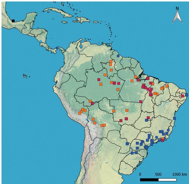
Figure 4. Map of Phaonantho species with geopolitical borders: P. benevola (orange); P. mallochi (blue); P. sordilloae (red); and Phaonantho sp. (black). Circles = literature records; square = new records.