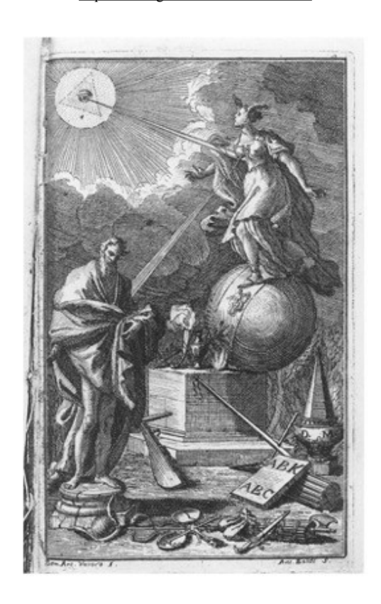
Fig. 2: Frontispiece of Giambattista Vico's La Scienza Nuova (1744)

Vico's first object of contemplation is language. Human beings create their world through poetic forces and mythological interpretations. Homer (not Adam) is the creator of the world full of stories surrounding and explaining the world. Philology is the science deciphering these signs on the surface of all created things. <sup>11</sup> Vico's figuration of Cebes is a figure of the text in linear order that moves chronically forward, whereas the image itself shows a constellation of figures that unfold simultaneously in front of the eyes of the viewer. <sup>12</sup>