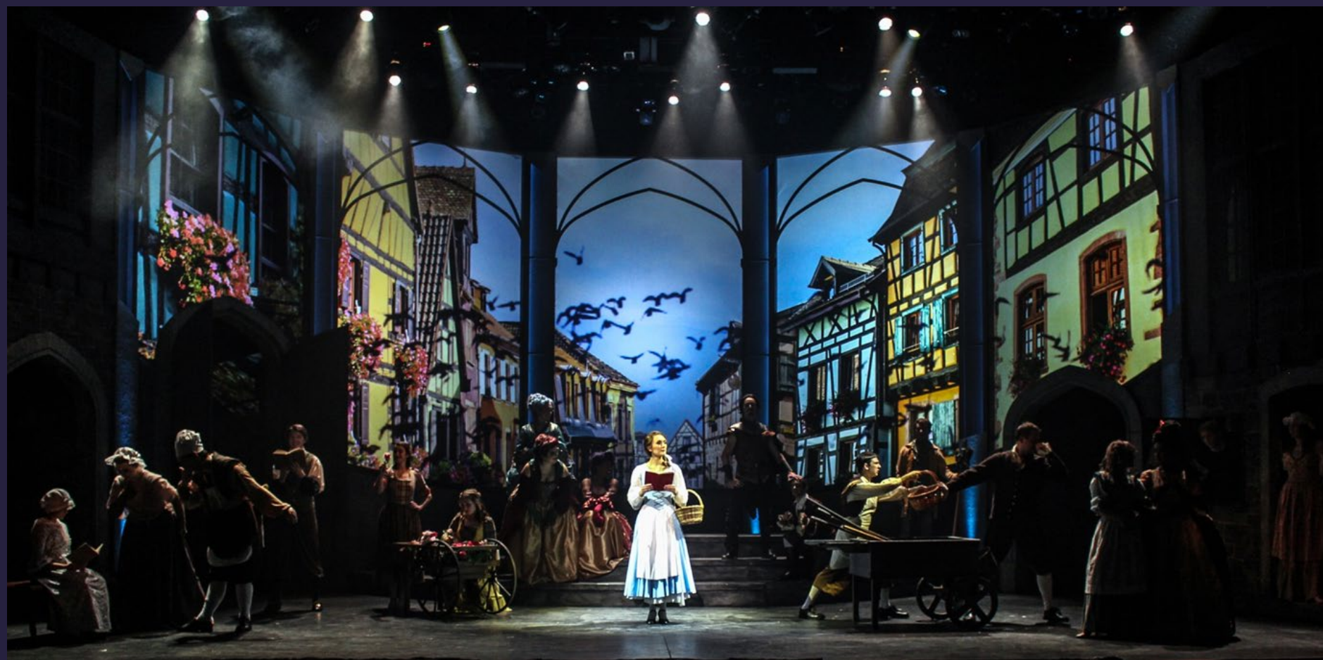
Button of "Belle" after audience has met Belle and Villagers