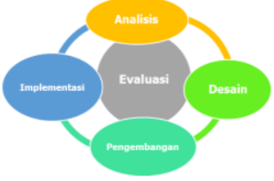
Figure 1. Research design using the ADDIE model

This type of research is development research (research and development). The model used in this research (Darmayasa I Kadek, Jampel I Nyoman, 2018), ADDIE, has 5 stages, starting with analysis of data from interviews with related parties (analysis), designing designs (design), designing into program code (development), integrating designs into programs and testing (implementation), evaluating applications to determine whether there are failures and system errors, and application maintenance.