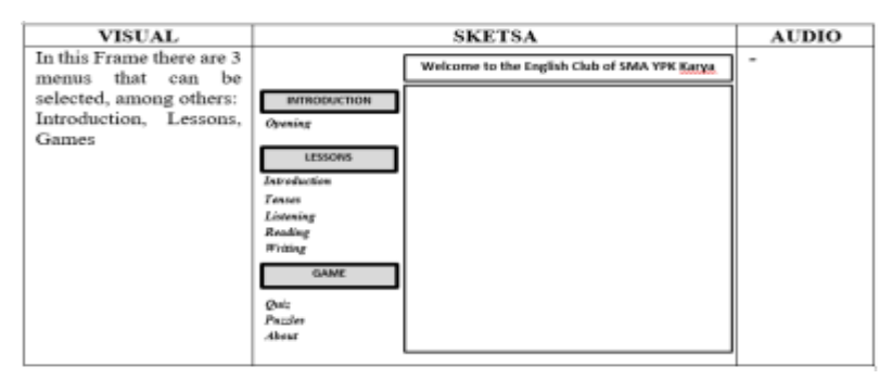
Figure 2. Main Menu Storyboard

The second stage is the design. At this stage, the display design is needed to process information and convenience users so that it can be understood by them. Thus, this display design can provide information in accordance with the objectives to be achieved. The tools used to design use the Flash Professional CS5 application, which is specifically designed to create animations, and Photoshop 7.0 for image creation. The following is a picture of the flow of the application.