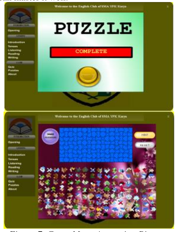
Figure 7. Game Menu Arranging Pictures

In Figure 6, the quiz menu is displayed, and students can choose quizzes in the form of multiple choice and word searches. The purpose of this quiz is to evaluate whether students can master it well.