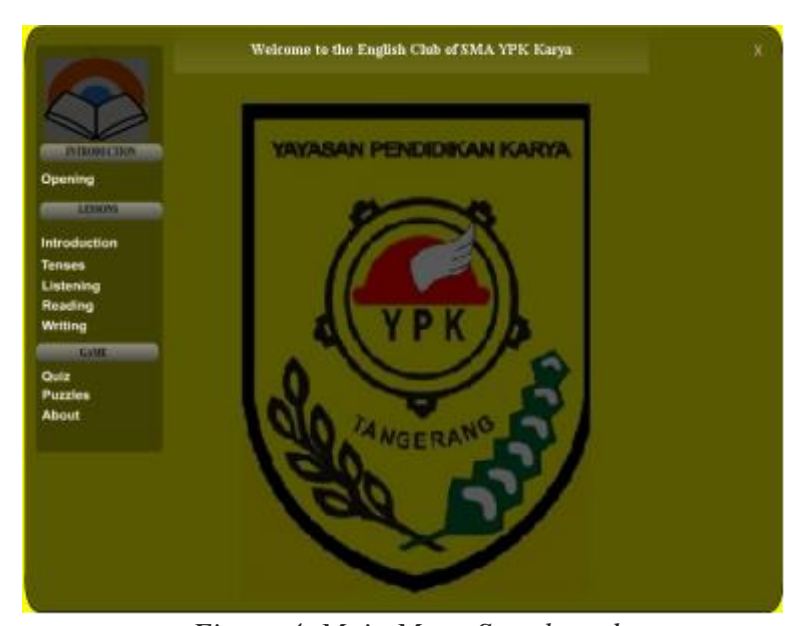
Figure 4. Main Menu Storyboard

The third stage is development; at this stage, the implementation of media development is adjusted to the design The results of the software 's development into multimedia applications are presented in the figure below.