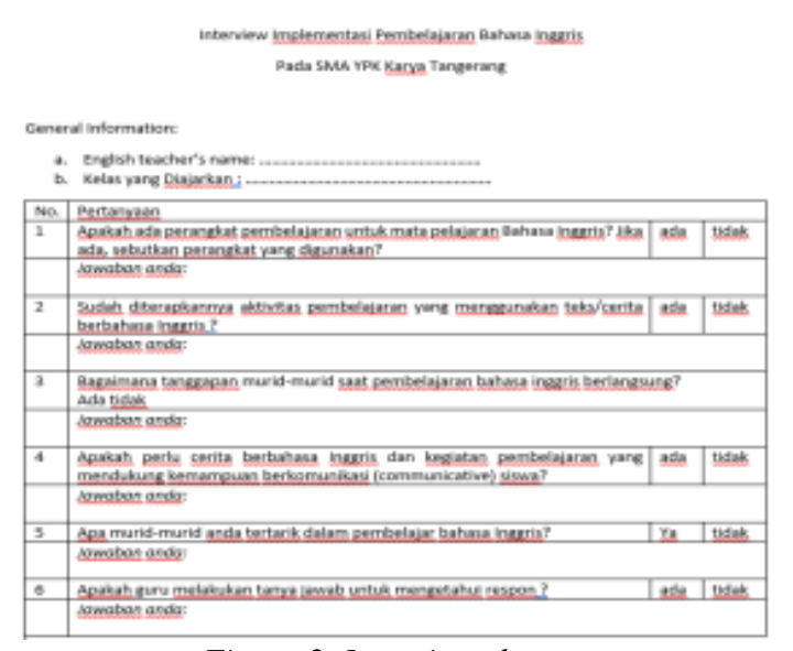
Figure 2. Interview sheet

The stages of developing English learning multimedia applications at YPK Karya High School use the ADDIE development model. The first stage is analysis. At the analysis stage namely analyzing the problems of learning English for students and media analysis, based on the results of the analysis, it was found that the ability to listen, write, and speak English was still lacking. In addition, there is a lack of learning media that can facilitate children's independence. From the results of observations and interviews with principals and teachers, there is a problem in the delivery of English learning vocabulary that is less clear in acceptance or lack of understanding and learning media that are less varied to increase students' English vocabulary knowledge. There are still some students who do not know the English vocabulary well.