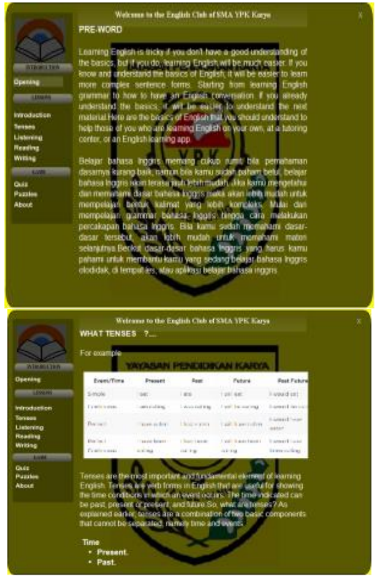
Figure 5. Learning Menu

In Figure 4, this main menu display contains 3 menus: the introduction menu has an opening menu, the learning menu has a background menu, tenses, listening, reading, and writing, and the game menu has a quiz menu (multiple choice and word search), puzzle games, and a maker background.