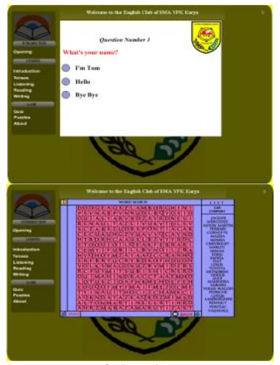
Figure 6. Quiz Game Menu

In Figure 6, the quiz menu is displayed, and students can choose quizzes in the form of multiple choice and word searches. The purpose of this quiz is to evaluate whether students can master it well.