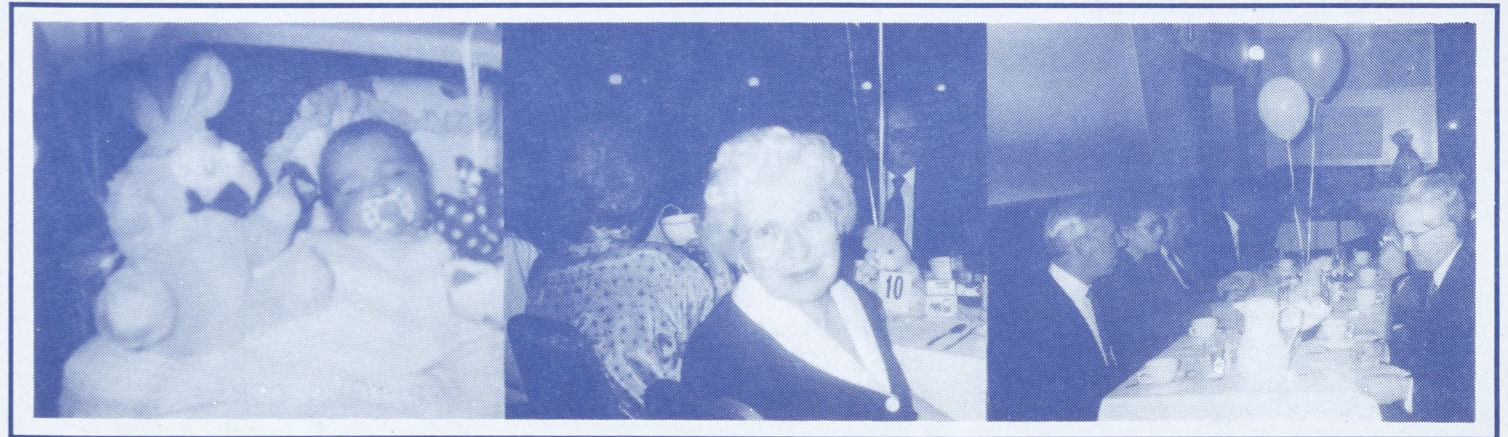
Everyone was there!