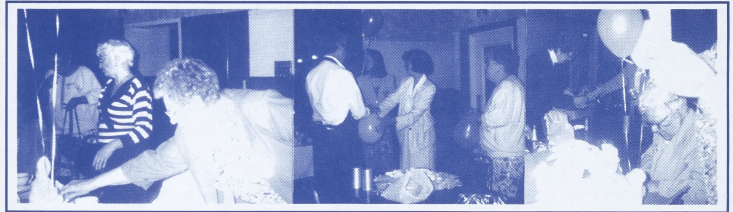
A lot of preparation is necessary...

If a picture's worth a thousand words, here's a few thousand words about the 2nd Annual Spring luncheon, hosted by the Share Service League. The event was held March 24 at Scherwood South in Schererville. Nearly 500 people attended and a profit of over $8,000.00 was realized!