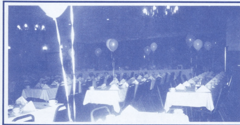
To get a room to look this beautiful!