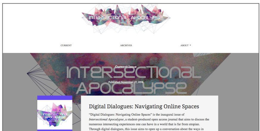
FIGURE 1: A SCREEN CAPTURE FROM THE OPENING PAGE OF THE JOURNAL, WHICH THE STUDENTS COLLECTIVELY DEVELOPED ON OJS, TITLED INTERSECTIONAL APOCALYPSE . AVAILABLE ONLINE AT: HTTPS://JOURNALS.LIB.SFU.CA/INDEX.PHP/IFJ .

In a similarly innovative way and in relation to the limitations of peer review as discussed earlier, the students decided to remake peer review as a site of workshopping and collaboration. As they collectively wrote: " Intersectional Apocalypse aims to uplift and nurture knowledge in all forms, including through our peer review process. To do this, we believe it is imperative to push the boundaries of what peer review is and how it is conducted" ( https://journals.lib.sfu.ca/index.php/ifj/reviewpolicy ). Their solution to developing a networked and nurturing model of a workshop-based peer review involved asking contributors to also act as reviewers. While this sounds simple, it was modeled on imagining what both authors and