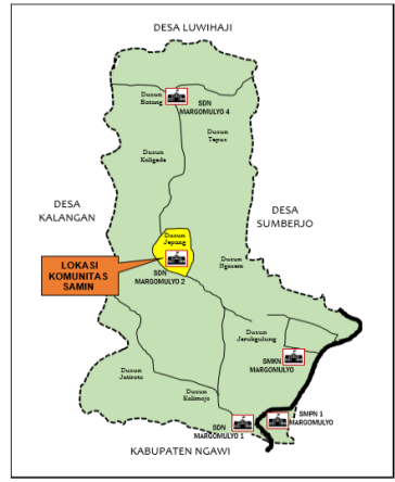
Figure 1. Map of School Distribution in Margomulyo Village

First stakeholder mapping. Transforming community values through education cannot be done just like that, considering that many interested parties must receive attention. These parties are the key to the success of the transformation process. At least at the mapping stage, this research sees three stakeholders who need attention so that