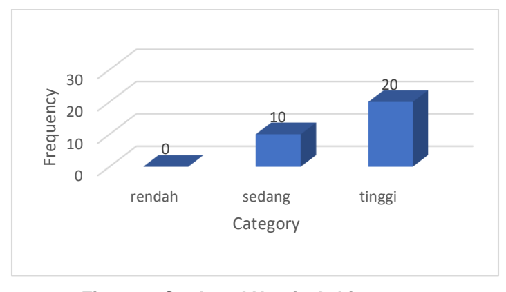
Figure 2. Students' N-gain Achievement

Based on Table 2 above, the average score of students before learning was 26.29, then it increased after learning with an average value of 80.50. The results of the science process skills test obtained were then carried out by N-gain analysis to find out the increase in science process skills. The results of the N-gain analysis are presented in Figure 2 .