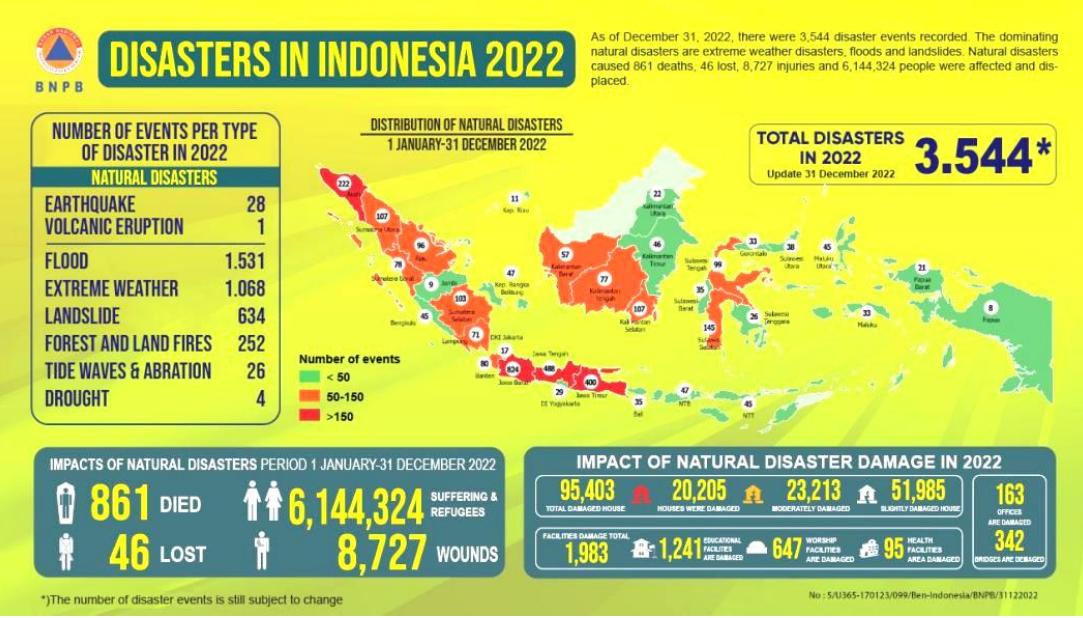
Figure 1. Indonesia disaster infographics in 2022.

The majority of these houses are from middle to lower-class groups, it is the largest population in Indonesia. Based on data from the World Bank in 2019, the majority of Indonesia's population is middle to lower divided by middle class (44.5%) and poor (11%). Due to growing demands for more inexpensive basic housing in Indonesia, vulnerable houses continue to develop among low-income and low-to-medium-income communities (Saputra et al., 2017). Lots of previous research emphasized that these groups are the most vulnerable and impacted during a disaster (Yaseen, Saqib, Visetnoi, McCauley, & Iqbal, 2023). Studies show that low-cost houses are more vulnerable to the risk of disaster for several reasons (Charlesworth & Fien, 2022; Ma & Smith, 2020; Pujianto, Prayuda, & Monika, 2019): poorly constructed houses as often built based upon experiences of local masons without technical designs and construction supervision (Tipple, 2005), and mostly located in higher-risk places due to high land prices or even worst (Ma & Smith, 2020 ), living in informal settlements.