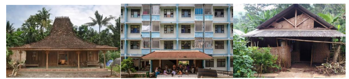
Figure 3. Types of houses excluded in this study: vernacular houses in Java (left); flats (middle); and Uninhabitable Houses/RTLH (right).

Another type is vernacular housing. The traditional dwellings have developed to respond to natural environmental conditions, particularly Indonesia's warm and wet tropical climate (N.C. Idham, 2019). In the wealth of archipelago architecture, there have been many studies that prove that vernacular buildings are resistant to several natural disasters such as earthquakes (Putra, 2020) and floods (Nyssa, Susanto, & Panjaitan, 2022). This study also eliminates vernacular housing because they are better at responding to natural disasters, yet this type of house constructed traditionally is rarely built because of the level of difficulty of construction as well as natural materials that are hard to come by. The government offers affordable apartments to the lower middle class, but this still appears to be unsuccessful (Rosadi, Meizy, & Suryanto, 2010). This type of residential with the form of high-rise buildings is also excluded in this study because it needs specific analysis and is not a majority case in Indonesia.