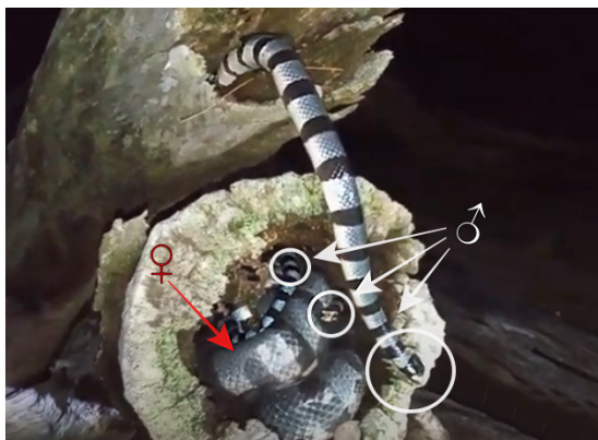
Figure 2. The courting group of Yellow-lipped Sea Kraits ( Laticauda colubrina ) inside the tree cavity (female body visibly larger than the males).

Our observation on Rutland Island adds to the list of known breeding populations for the Yellow-lipped Sea Krait in the Andaman and Nicobar Archipelago. Sea kraits are highly philopatric and considered to be seasonal breeders (Shetty 2000; Shetty and Shine 2002). Bhaskar (1996)