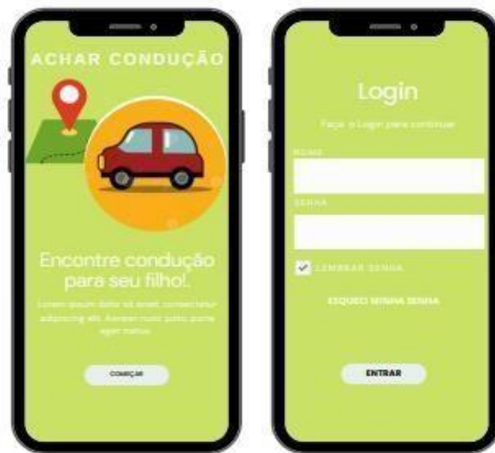
Figure 01: Home screen and login screen.

One of the main objectives of the app is to identify the driver's personal and professional qualifications, in addition to the documents relating to the vehicle, through the driver's registration, and the attachment of supporting documents is mandatory to ensure the safety of children. It can be seen how this process will be carried out in figure 02.