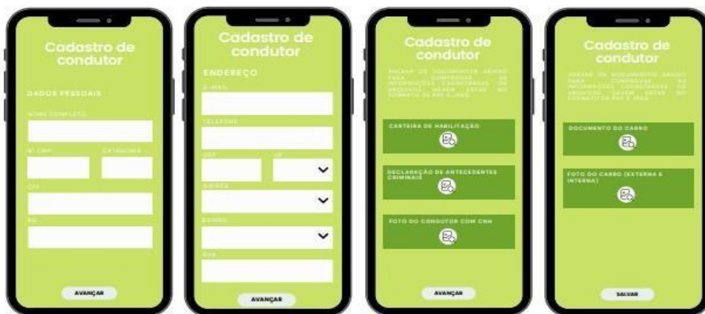
Figure 02: Driver registration screens.

One of the main objectives of the app is to identify the driver's personal and professional qualifications, in addition to the documents relating to the vehicle, through the driver's registration, and the attachment of supporting documents is mandatory to ensure the safety of children. It can be seen how this process will be carried out in figure 02.