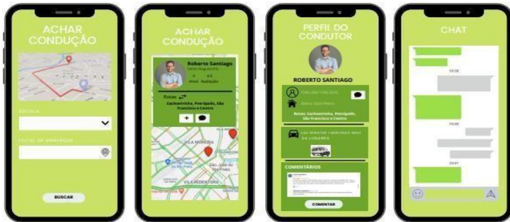
Figure 03: Location driver profile and chat screens.