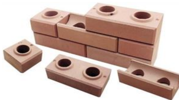
Figure 1 - Ecological Brick

According to the ABNT NBR 8491/2012 Standard, ecological brick or cement soil (figure 1) presents in its composition of soil, Portland cement, water and additives (if necessary), however one of the fundamental components for masonry consists of soil, which must not present organic matter in levels harmful to its properties. Regarding the quality control of the brick, the standard makes very clear some questions such as the minimum compressive strength must be 2MPa, the absorption should be around 20% and cannot exceed 22% in tests.