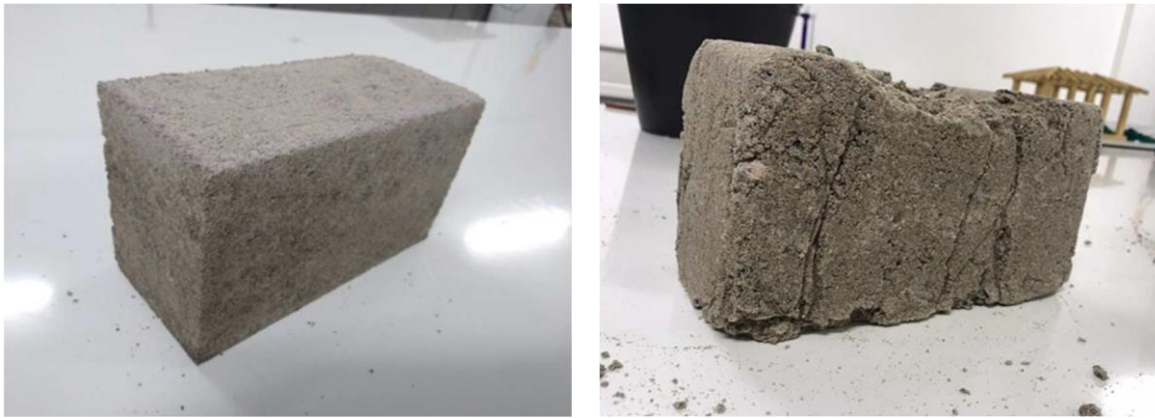
(a) 10% de PET