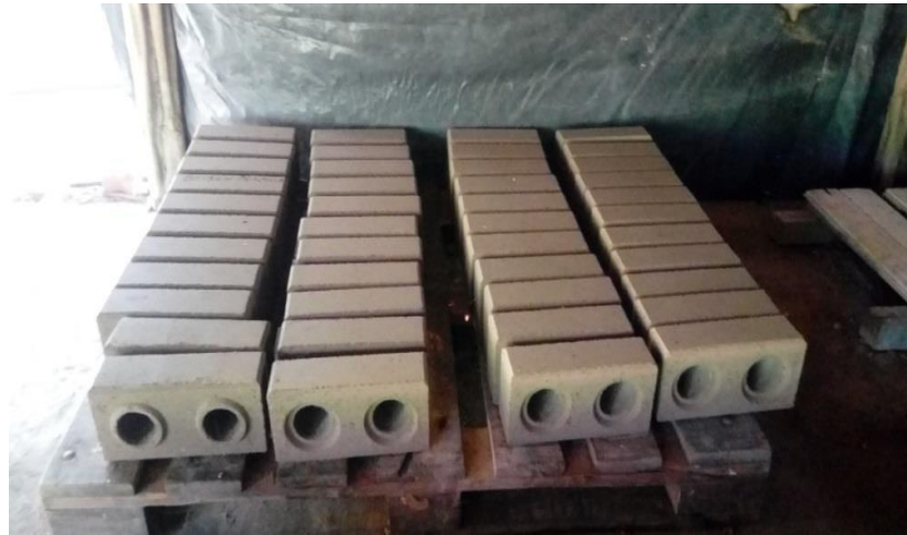
Figure 2 - Ecological Brick with Babaçu Coconut Fiber

it decomposes after a certain time, in Carvalho (2019) presents in his research the use of babassu coconut fiber (figure 2) as an addition to make analysis of the resistance parameters, and found with the addition of 1.5% there is an increase in the mechanical resistance over the curing time being propitious for commercialization in the market.