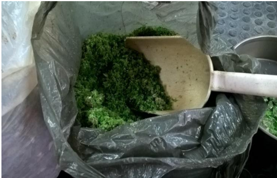
Figure 6 - Crude PET waste

Unlike styrofoam, there is another polymer that has better results, PET (figure 6), as can be seen in the work of Sena et al (2016) whose replacement in percentages of 5, 8 and 11%, in order to highlight the resistance of the ecological brick and compare with the normative limit, in order to determine which ones are more suitable for civil construction, in which the only satisfactory corresponds to the norm corresponds to 11%, however the research standard shows a resistance below 1.5 MPa proving that all percentages are adequate.