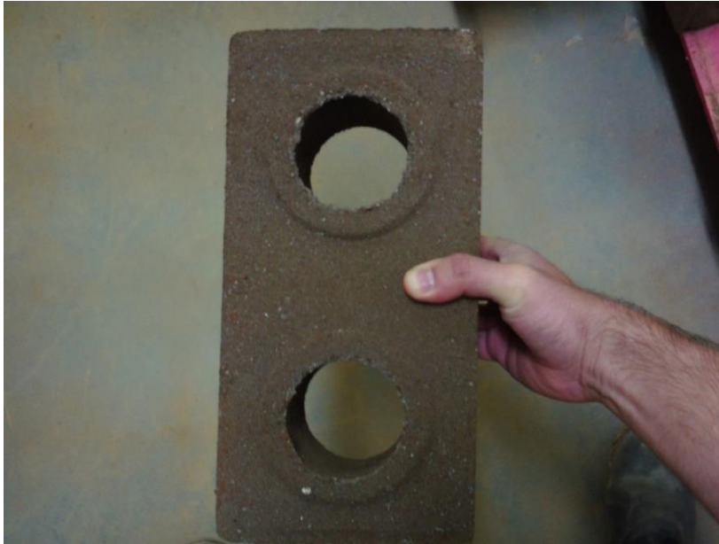
Figure 4 - Ecological Brick with Civil Construction Waste

absorption indices, not corresponding to the normative limits, this fact must have occurred because of the amount of increase incorporated in the line, damaging it or as a result of the porosity of the material, decreasing from its final characteristics significantly, but the study makes a beneficitation to Civil Construction Waste.