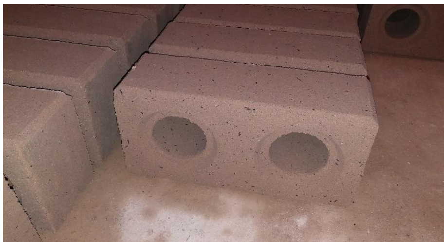
Figure 3 - Ecological Brick with Tire Residue

The fact of inserting other materials in the composition of the brick, in order to provide sustainability, does not necessarily have to be only recyclable materials, but reusable like the fact of tire rubber, where it is usually used in the preparation of the asphalt, however Gomes (2018) applied rubber residues to the brick (figure 3) proving the decrease in resistance when adding 9% compared to the initial material, in addition to having a very significant deformation due to this increase and recommending the use of clay soils, with the intention of facilitating the control of compaction in the mold.