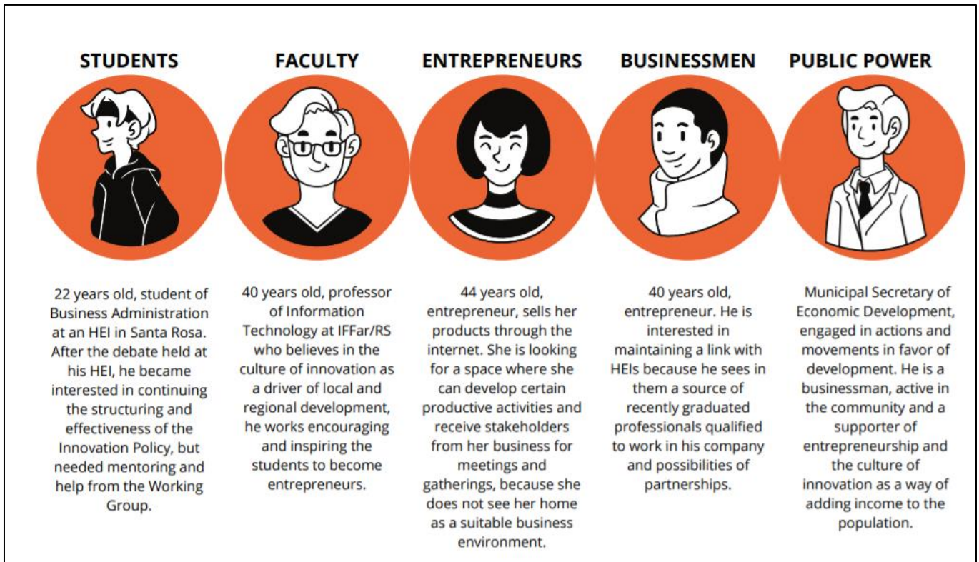
Figure 3. Personas of Santa Rosa