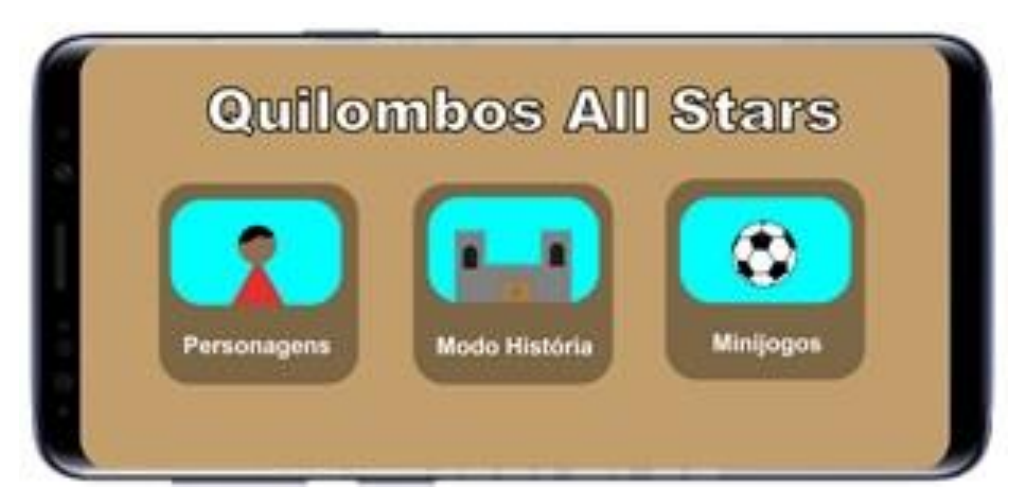
Figure 1: Main Menu

Several game modes have been defined to make a more intuitive interface, as seen in Figure 1, for the user to orient themselves within the game. There are tabs through which you can get to know important people better, considered leaders in the quilombola territory, understand a little of the culture from the functioning of the archaeological site and the championship, with mini-games, or learn about the history of the Quilombola Territory of the Jambuaçu River and their communities through a platform game, evaluating the content discovered through quizzes.