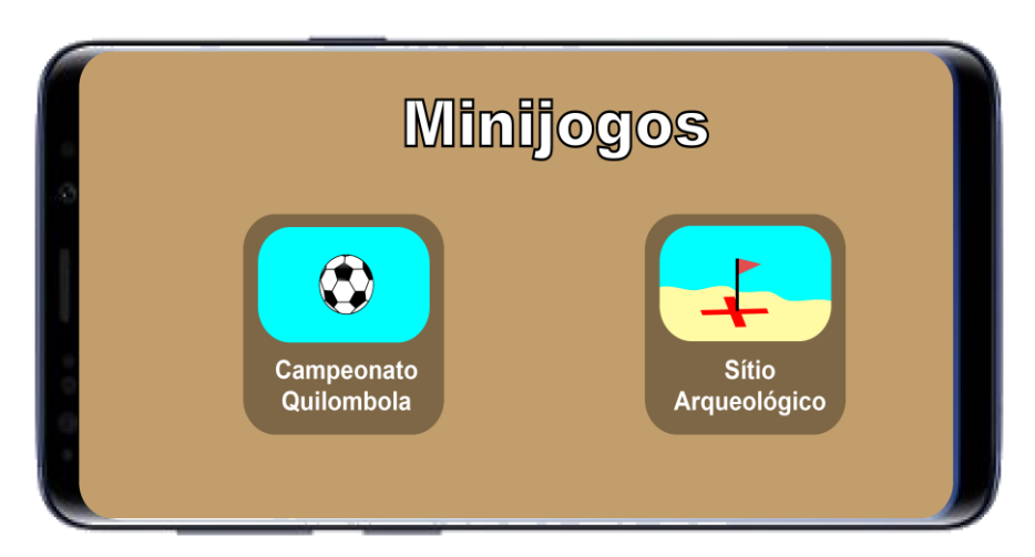
Figure 3: Screen with mini-games

Through the mini-games, users will be able to better understand the culture of the quilombolas through two games, one about the functioning of the archaeological site, present in the quilombola community of São Bernadinho / Moju - PA and the other about the quilombola championship. The mini-game menu can be seen in Figure 3.