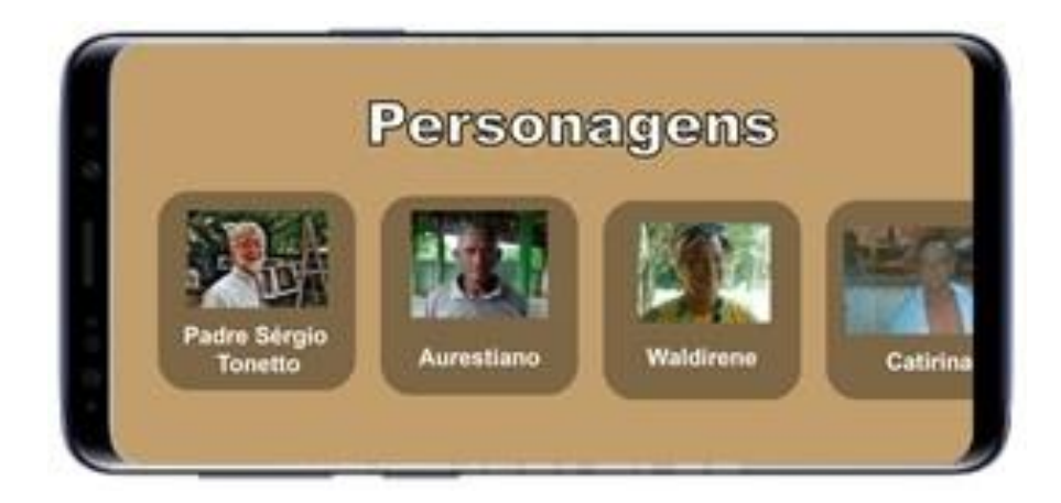
Figure 2: Main heroes of the quilombola territory of the Jambuaçu river.

For children and young quilombolas who will play, knowing the history of these characters and the formation of the territory where they live is important, in order to preserve this knowledge and pass it on to future generations.