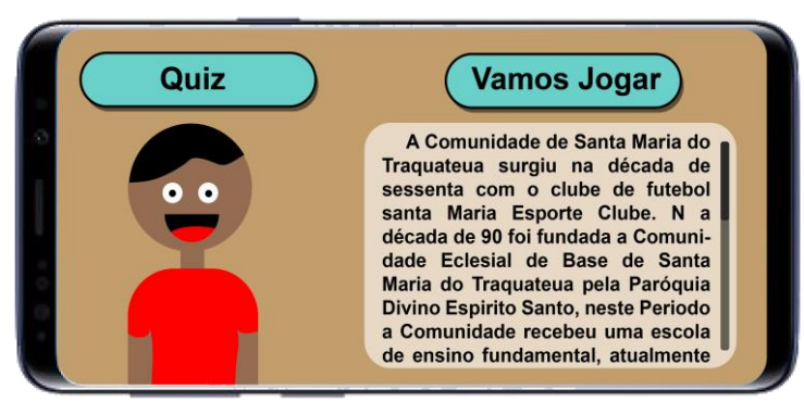
Figure 5: Menu with the history of a community.

When clicking on one of the communities, the user will be directed to a screen where they will have information on the chosen community, as seen in Figure 5, being explained through text or by a persona. With that, the player will be able to choose between doing a quiz about the community, for academic purposes, or playing within that community.