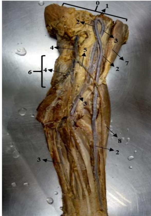
Figure 2. Brachial artery high bifurcation. Legend: (0) arm mid-third cross-section; (1) brachial artery bifurcation in arm mid-third; (2) radial artery; (3) ulnar artery; (4) basilica vein; (5) middle elbow vein; (6) cubital fossa; (7) biceps brachial muscle; (8) brachioradialis muscle.

Figure 1. Brachial artery and its arterial branches with cubital fossa bifurcation. Legend: (0) the instrument pointing to the humerus circumflex artery, branch of the axillary artery; (1) brachial artery; (2) deep brachial artery; (3) median nerve; (4) superior ulnar collateral artery; (5) biceps brachial muscle; (6) radial artery and (7) ulnar artery.