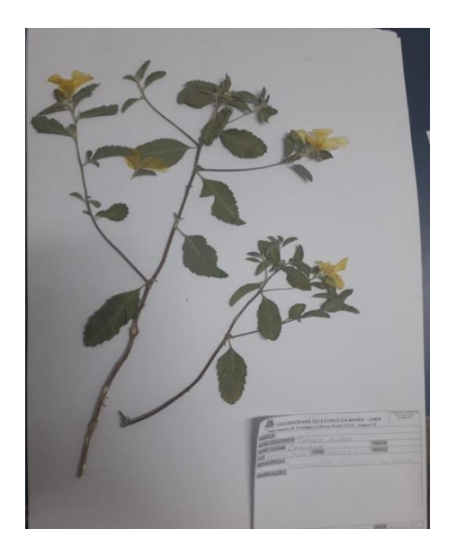
Figura 1. Exsicata da espécie Turnera diffusa WILLD depositada no Herbário da Universidade do Estado da Bahia.

The collection site of the plants was georeferenced with GPS and the plants photographed, then recorded in a field booklet information related to the vegetable, such as growth habit, height, color and flower odor; Fertile branches of "Damiana" were standardized with 40cm of stems, placed on planks and stored in greenhouses at 700 C for 72h. After drying, the plant material was placed in cardboard with a previously established size with the herbarium plug. To identify the plant species, the exsiccate was compared with others already identified in the Herbarium of State University of Bahia - UNEB, Juazeiro - BA.