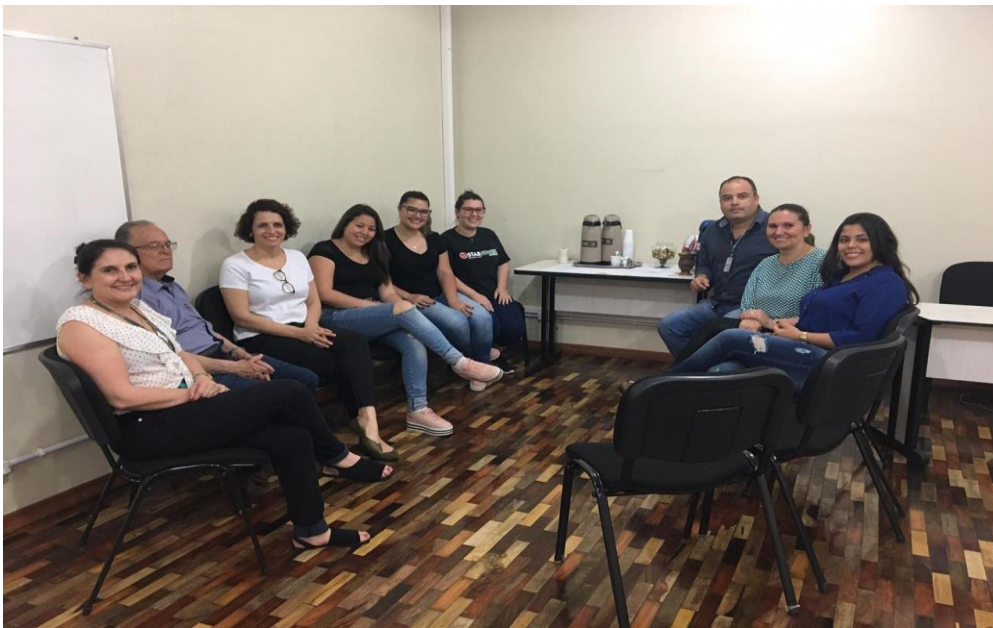
Figure 1. event organizers and collaborators 2019.