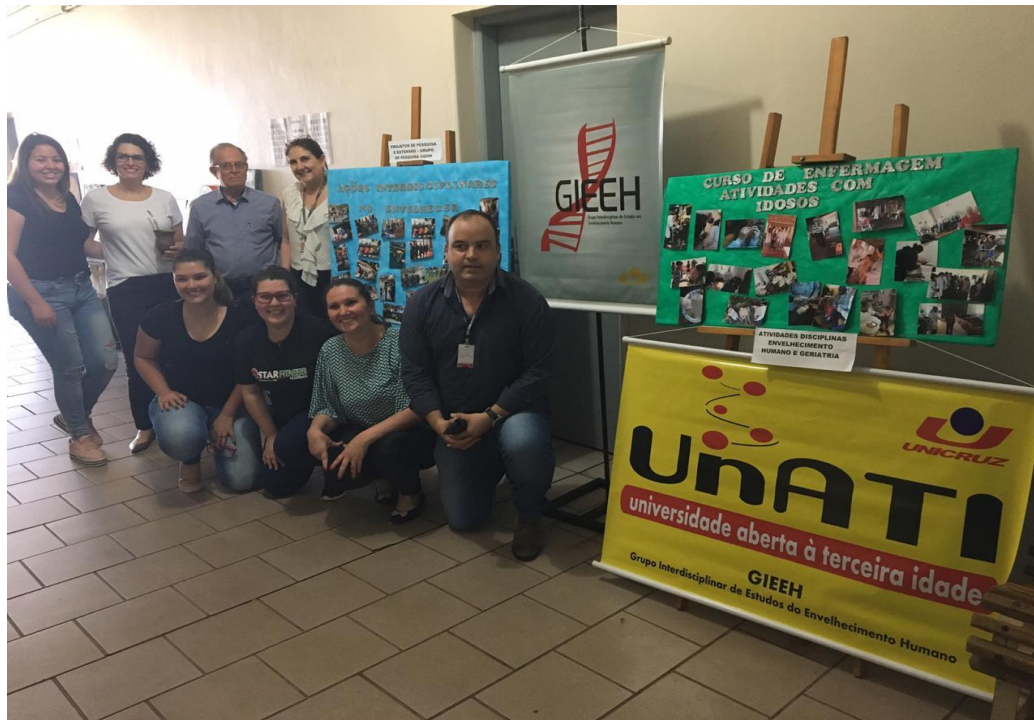
Figure 2. Event collaborators.