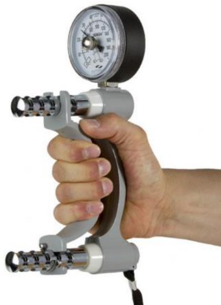
Figure 1. Jamar® hydraulic dynamometer.

In study IV, Jamar® dynamometer evaluation is an objective, practical and easy-to-use procedure that can be performed dynamically in the care of outpatient leprosy patients. However, in the same study it was observed that there was early muscle fatigue due to peripheral nervous impairment during the execution of handgrip strength caused by muscle weakness in leprosy patients when compared to healthy patients making it a difficulty at the time of evaluation [10].