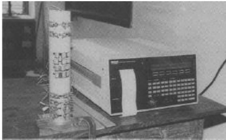
Figure 4. Instrument to measure hand grip strength.

In study I, they performed an analysis of the hand force distribution during maximal isometric gripping actions by means of a 50 mm, 75 mm and 110 mm diameter cylindrical tube. They showed that regardless of diameter having different thicknesses, there was no significant difference in hand grip strength measurement in leprosy patients [14].