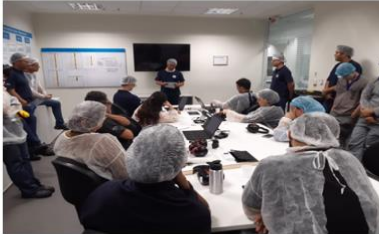
Figure 2 - Reading about the company survey