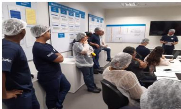
Figure 1 - Lecture with employees

Therefore, a case study was carried out in a factory located in the Manaus Industrial Pole - PIM, operating in the city for over ten years, with a total built area of 35.35 m 2 . The company is classified as large, has a total of 140 employees working in 3 shifts, working ninety-five hours per week, being divided into two areas, the production part and the administrative area. At the time, a lecture on energy efficiency and sustainability was given (Figure 1).