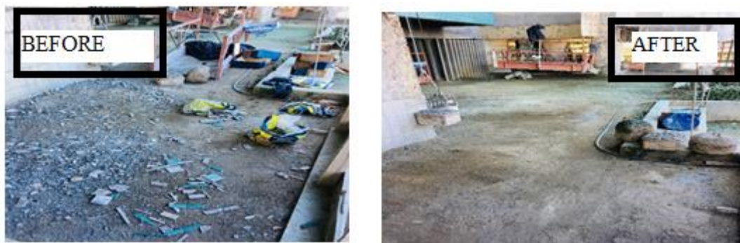
Figure 4 and 5: Activity performed in the first week (Organization of the flowerbed)

The first week of project execution was to separate what is useful from what is not, to improve the use of what is useful, to keep only what is needed on the construction site, to combat waste and idleness. Before week of use, it was possible to find several empty boxes in the sector, leftover shards, expired mortars, many useless equipment. In figures 4 and 5. An analysis of equipment and materials was made, and many of them were sent to the sector responsible for obsolete equipment.