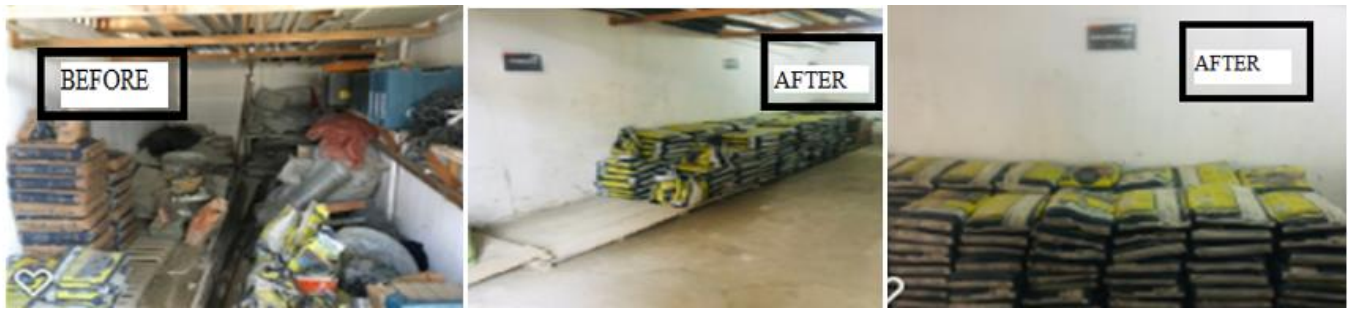
Figure 6, 7, and 8: Activity Performed on Week Two (Inventory Organization)