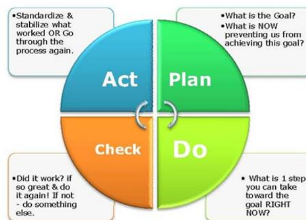
Figure 1 - PDCA Cycle

This cycle is uninterrupted and is intended for continuous improvement, because using what has been learned in one application of the PDCA cycle, another cycle can be started in a more complex attempt, and so on. With that, the last point on the PDCA cycle becomes the most important one, where the cycle will take on a new beginning [13].