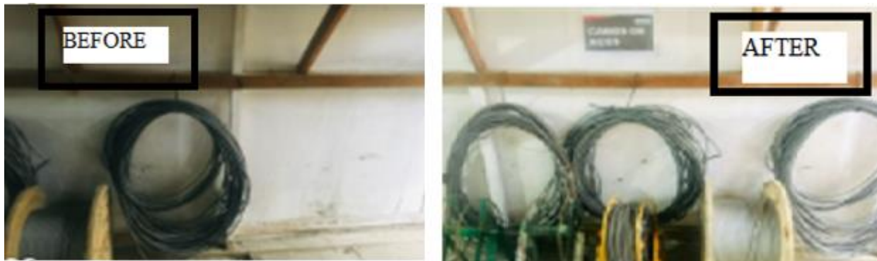
Figure 9 and 10: Before the cables were all thrown to the floor, now they are fixed to the wall (Organization of the flowerbed)

The third week, with the Sense of Cleanliness shown in figure 9 and 10, began to be streamlined, the whole sector was already visible along with the other senses there was already difference across the field. At this stage it was important not only to clean the environment but also to maintain it daily. The time has come to educate not to pollute, and always watch over all that is our responsibility.