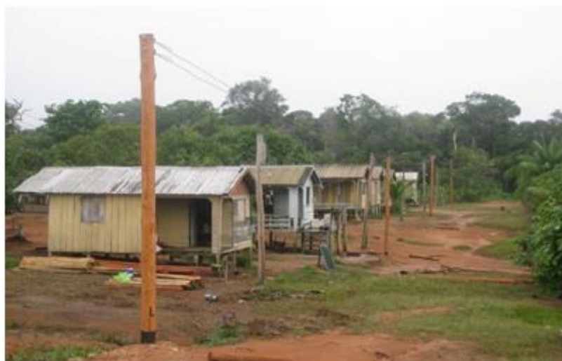
Figure 03 - Mini network distribution network

The electricity generated is distributed to the consumer units through a 127 V single-phase distribution network with bare aluminum cables, supported by wooden poles (Figure 3).