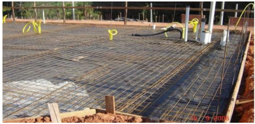
Figure 01: Radier type foundation

For hydrosanitary, electrical, communication, safety and others that may interfere with the radier, they are positioned before the foundation begins. The pipe is grounded and leveled where on the ground there is the launch of the counter floor concrete. Once this initial part is done, one must proceed to the base of the floor, so that they are developed, with more cleaning and efficiency (Figure 1).