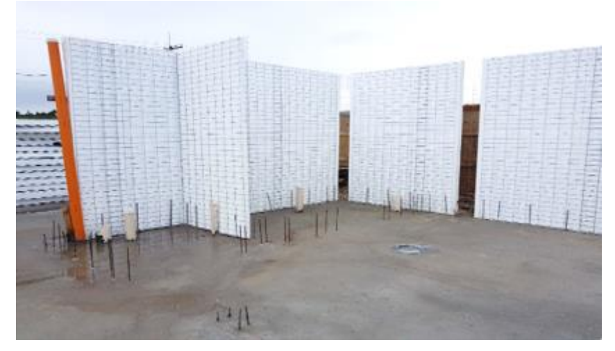
Figure 03: Panel fixed on the start-ups of the radier type foundation

The assembly of self-supporting panels is not complex, but requires care and standards to avoid misunderstandings in construction. They must be aligned with the iron guides of the contra piso and mounted on the plumb, where the fixation is made by clamps and annealed wires. The panels will be numbered by the manufacturer of the construction system and the mesh tabs of each panel must overlap the tabs of the next panel for composition of the monolithic assembly (Figure 3).