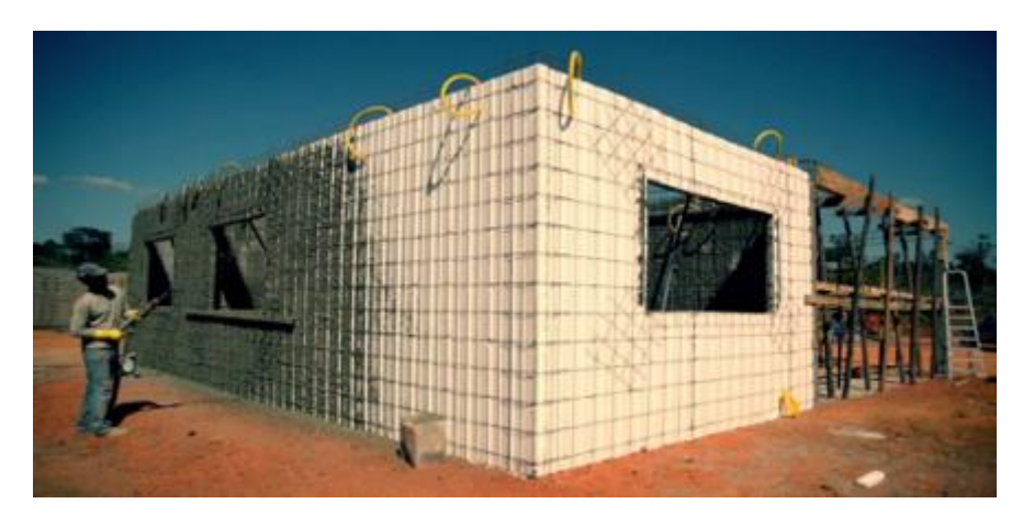
Figure 05: Application of microcement with equipment