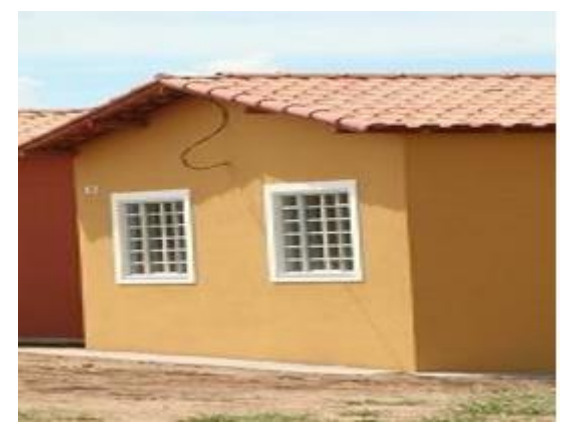
Figure 06: Final Finish

In the application of the finishes there is nothing different from the others, it will be carried out in the same way as a conventional system, such as the application of tiles, plaster or mass running (SILVA, 2009) (figure 06).