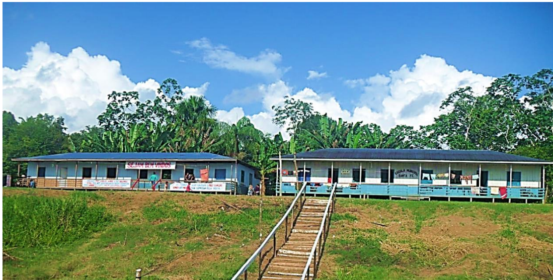
Figure 2. Community of Santa Fe - AM.

For the pumping of water directed to the residential supply, the site dimensioned in this work was designed a photovoltaic system with analysis according to data obtained in the field, where the system consists of a photovoltaic arrangement, a charge controller, a battery bank, a inverter and a motorbike bomb. Water is collected through an artesian well where water is pumped to a water tank. Soon the design was implemented in the center of the community, where are located the two schools that are right in the center of the zone to be able to serve the riverside population, as shown in figure 2.