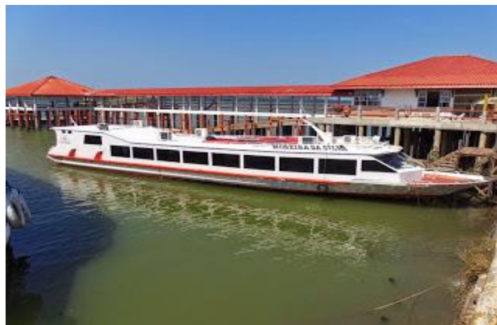
Fig 6: Express boat

To get the budget of this boat, of nautical companies and assemblers in Manaus and in the region or in companies of other States, a nautical project is required, where the main characteristics of the vessel will be presented as number of seats, dimensions and type of engine. The final stage of this project will budget the final costs through a bidding notice. For this proposal it was possible to obtain a sale value of boats already existing in the market (used), which will serve as a basis for calculating the final cost of implementation of this waterway. The images below illustrate some models of these speedboats used for passenger transport.