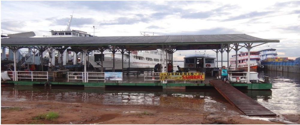
Fig 4: Floating ferry with fingers from behind.