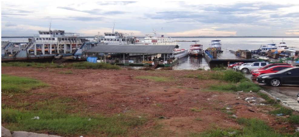
Fig 5: Floating ferry with fingers in the port of São Raimundo Manaus