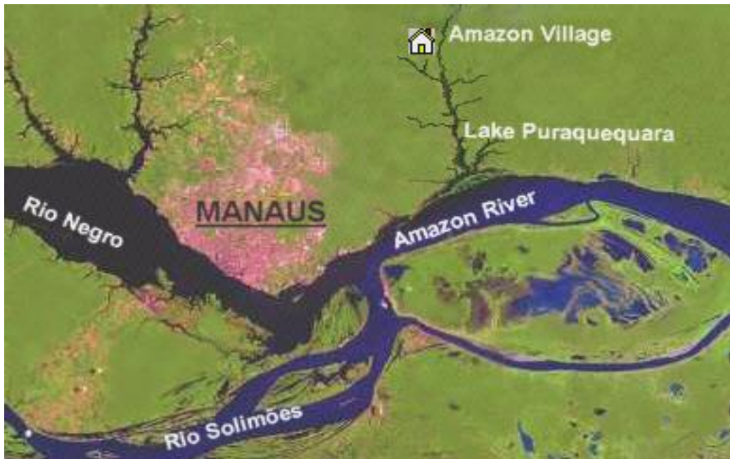
Fig.1 : Map of the Rio Negro location