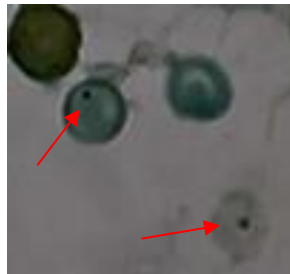
FIGURE 2 - Micronuclei (red arrows) in mouse erythrocytes ( Mus musculus L.) gives Swiss strain exposed to aqueous extracts of fresh leaves Cymbopogon citratus (AD.) Stapf. Orally, in a single dose. Total x400.

By bending the concentration of the aqueous extract of fresh leaves of lemon grass, bent also genotoxic effects on bone marrow of mice, inducing a higher frequency of micronuclei (FIGURE 2), which may be the result of chromosomal damage or damage of the mitotic apparatus of erythrocyte hematopoiesis.