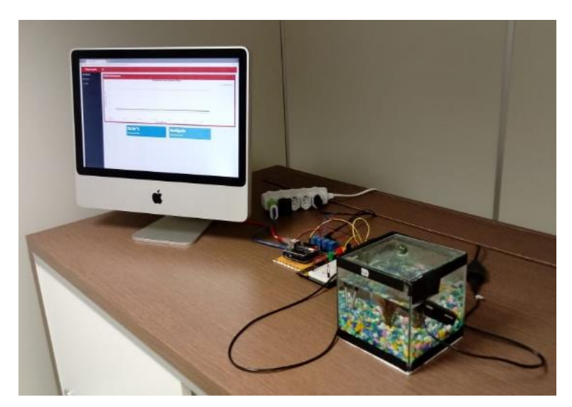
Figure 3. AcquaSmart development environment.