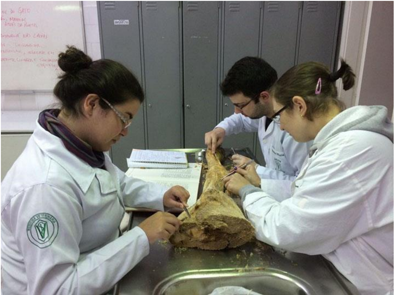
Figure 5. Students learning how prepare the dehydrated anatomical pieces – Complementary Formation in Morphological Science Assignment.