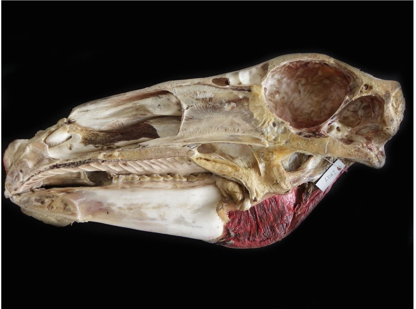
Figure 2. Cryodehydrated heads of dog (A) and horse, B – lateral view and C –medial view.