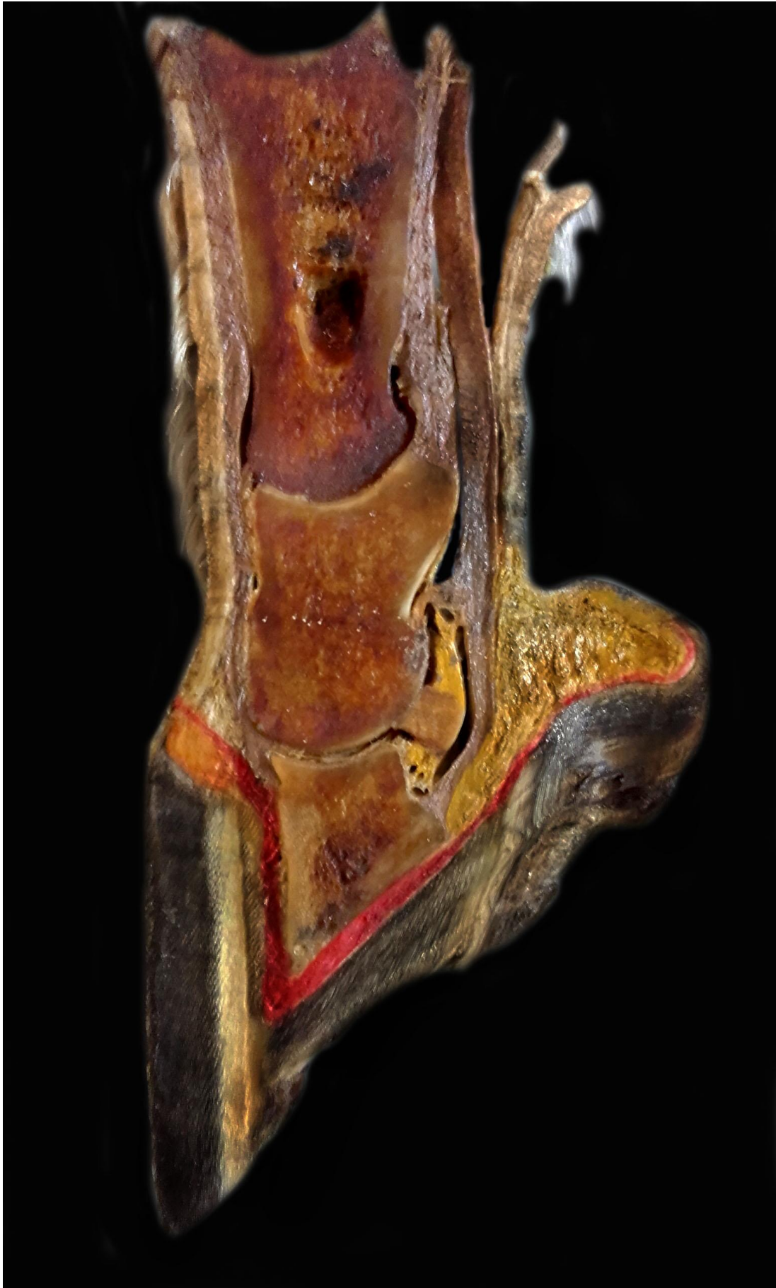
Figure 4. Cryodehydrated sagittal section of the hoof of equine.