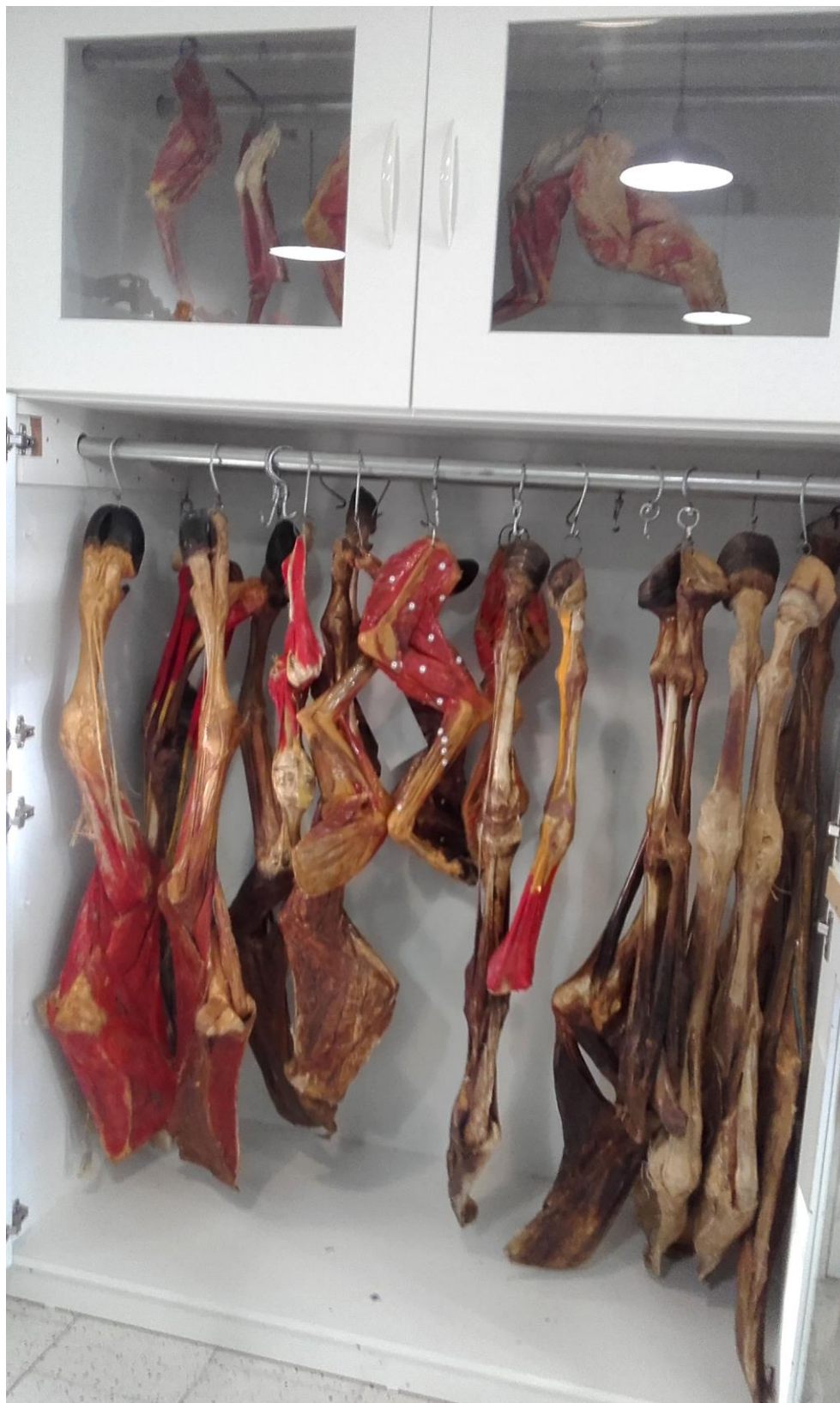
Figure 1. Dehydration thoracic limbs (bovine, equine and canine) storage in cabinets at laboratory.