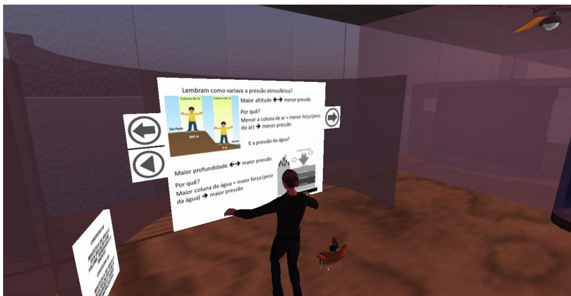
Figure 5: Slides room

In the slide room, theoretical presentations were available as short topics about the units comprised by this experiment, in the same format of exhibition used in presentation editors such as the PowerPoint. Figure 5 presents an illustration gathered during the experiment, where an Avatar is reading about atmospheric pressure and water pressure, directly in the Virtual World.