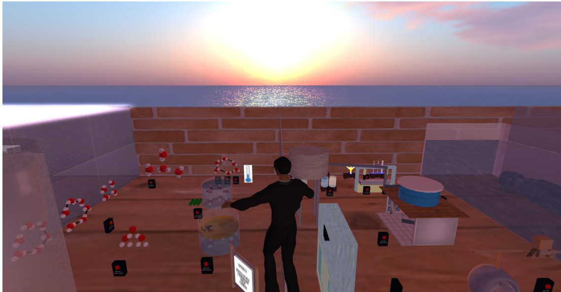
Figure 7: Simulations of the water molecule

Simulations available can be presented in a static way, where users click on a Button to receive information about the experiment they are viewing or can be animated. In this last, when the user clicks on the button to start the experiment, several pre-defined actions took place to show the phenomenon in a practical way. Figure 8 shows other examples of simulation.