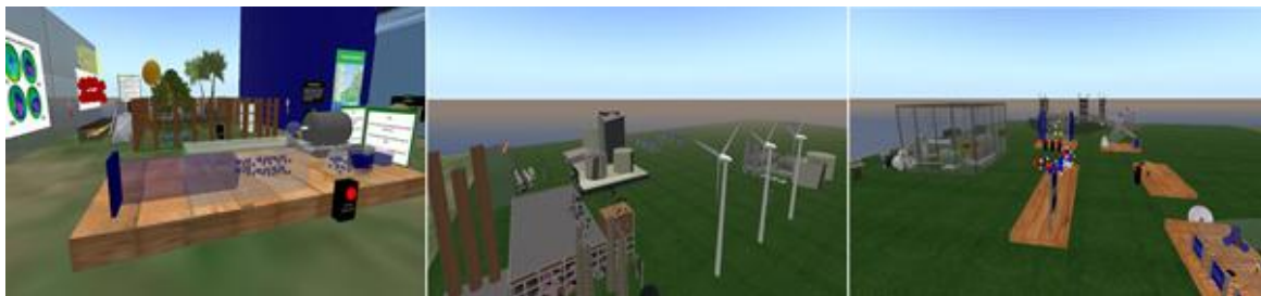
Figure 8: Simulations in the other labs

Simulations available can be presented in a static way, where users click on a Button to receive information about the experiment they are viewing or can be animated. In this last, when the user clicks on the button to start the experiment, several pre-defined actions took place to show the phenomenon in a practical way. Figure 8 shows other examples of simulation.