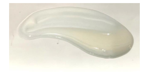
Figure 2. Texture of body cream containing patchouli oil and drumstick oil

Figure 2 illustrates the formulation's texture on application. In general, when the shear rates were increased, the cream viscosity tended to decrease. It appeared as though the produced creams had a shearthinning system, also known as a non-Newtonian flow. As the shear rates increased, the formulations went from having a higher viscosity to having a lower one. The viscosity of F0 and F1 did not statistically differ from one another (p> 0.05) when tested at speeds of 45, 60, and 90 revolutions per minute. According to Garcia-Olvera et al. (2016), the high number of organic acids in the oil was likely the reason of the lower viscosity of F1, which contained patchouli oil and drumstick oil. The formulations that contained patchouli oil and drumstick oil had viscosity values that were significantly lower than 1,000 cps. Therefore, it is anticipated that they will be simple to apply to the surface of the skin.