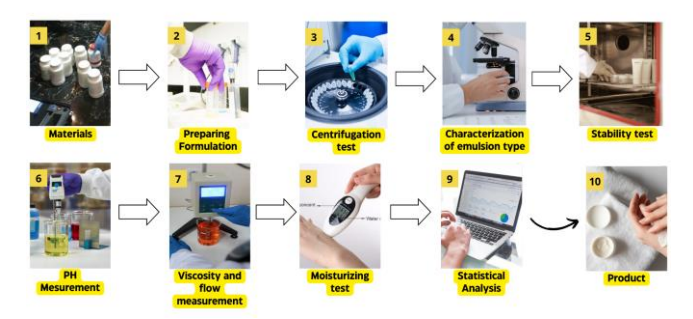
Figure 1. The schematic research procedure.

In this investigation, a light proportion of patchouli oil was incorporated into the production of body cream, containing drumstick oil, in the role of acting as a moisturizing agent. Niacinamide and drumstick oil, which functions as a skin brightener, and patchouli oil, which acts as an antibiotic and may be used on sensitive facial skin types, are both included in the formulation of the body cream, which uses only the finest components. The schematic research procedure is shown in Figure 1.