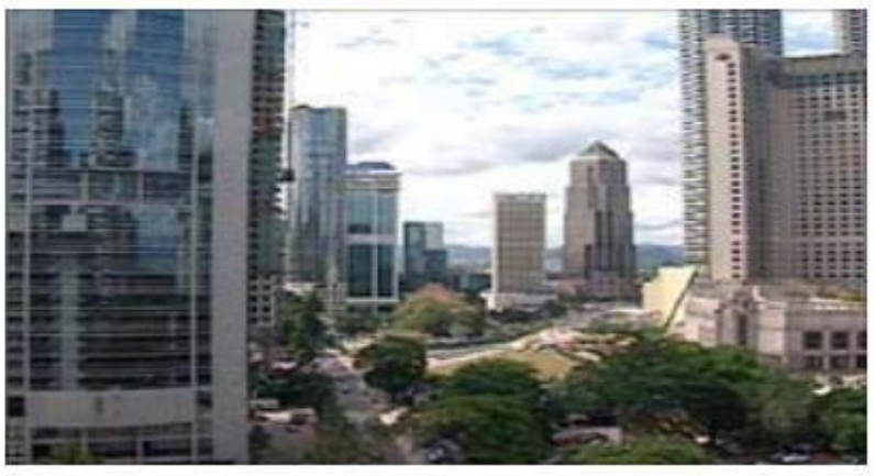
Figure. 1 In Malaysia, we notice the way the urban scene resembles that of the UAE with the known differences in customs, traditions, and architectural inheritance. This is known as the globalized model of the urban setting or the globalized city [25]