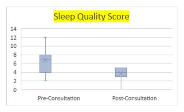
Figure 2. Paired Samples T-test for the Difference Between Pre- vs. Post Survey Answers for Sleep Quality. Whiskers indicate the minimum and maximum perceived stress scores. The mid-line represents the median, and the dots represent the outlying points. The beginning of each box indicates the lower quartile scores, whereas the end of each box represents the upper quartile points