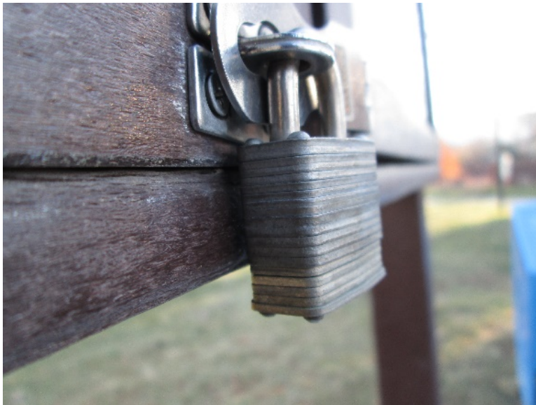
Figure 1. A Boulder youth took a picture of this lock to represent “the bonds of brotherhood” that helped support his resilience. Other youth viewed the lock as a symbol of the cultural oppression

In general, children identified access to nature and family, friends, and supportive networks (from school and community), along with activities that help young people develop skills, as supporting resilience. Children and youth identified social, environmental, and economic concerns, including the need for greater care of homeless residents, fracking, and the cost of living, as vulnerabilities in the community. Children spoke about bullying and youth spoke about a feeling of cultural exclusion as aspects of their community that need to be addressed within the city (Figure 1). High school students who participated in the poetry project described moments of resilience, particularly in dealing with a recent flood in Boulder along with coping with serious family health and immigration issues, these being the times they needed supportive networks and resilience the most (GUB, 2015, 2016).