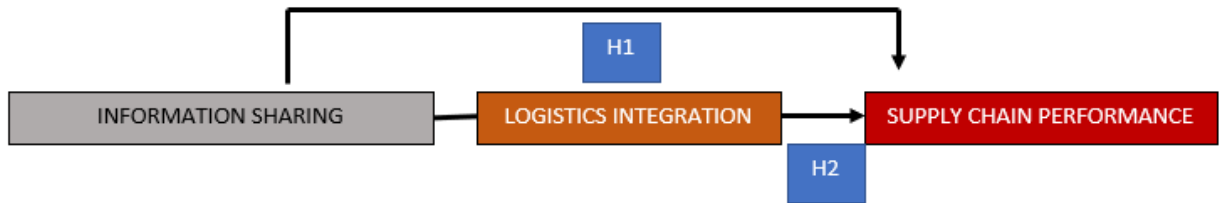
Fig 1: Theoretical Framework