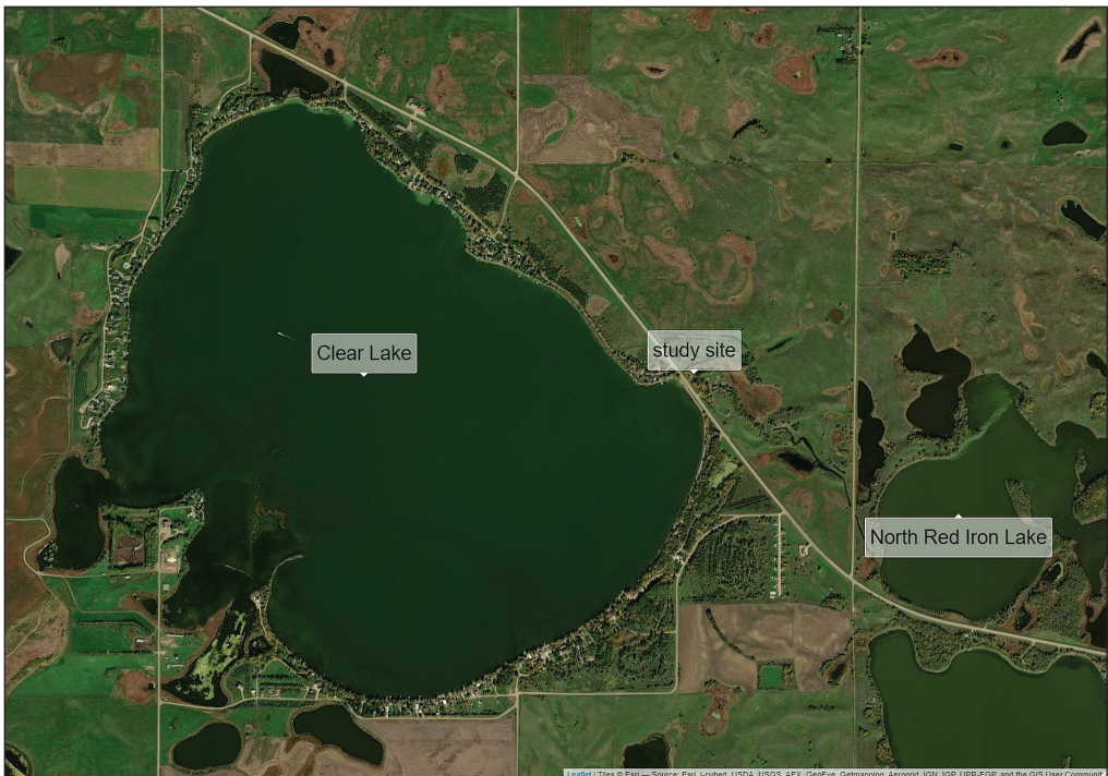
Figure 1. Aerial photo of Clear Lake, Marshall County, South Dakota, including North Red Iron Lake and the location of the study site ( https://www.arcgis.com/apps/mapviewer/index.html?layers=10df2279f9684e4a9f6a7f08feb2a9 ).

Catch per unit effort (CPUE) was calculated as (number of turtles caught in basking and hoop traps) divided by (number of traps x number of hours each trap was deployed) for the number of turtles per trap-hour (turtles/trap-hr). Due to the complexity of the habitat, turtles caught by hand or dipnet were the result of opportunistic encounters rather than structured searches; therefore, we did not calculate CPUE for these capture types.