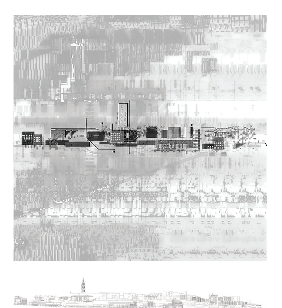
UP: Fig. 2. Diagram analysis of the street front of Kosančićev Venac. DOWN: Fig. 3. Kosančićev Venac elevation.