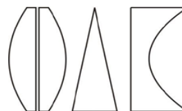
Optical Society of Serbia

Other institutions that helped the organization of this event are: Institute of Physics Belgrade, University of Belgrade ( www.ipb.ac.rs ), School of Electrical Engineering, University of Belgrade ( www.etf.bg.ac.rs ), Institute of Chemistry, Technology and Metallurgy, University of Belgrade ( www.ihtm.bg.ac.rs ), Faculty of Technical Sciences, University of Novi Sad ( www.ftn.uns.ac.rs ), Faculty of Physics, University of Belgrade ( www.ff.bg.ac.rs ), and Faculty of Biology, University of Belgrade ( www.bio.bg.ac.rs ). Joint event “Machine learning with Photonics Symposium” has been co-organized with programme partners H2020-RISE-CARDIALLY, H2020 – MULTIPLY and H2020-EID-FONTE.