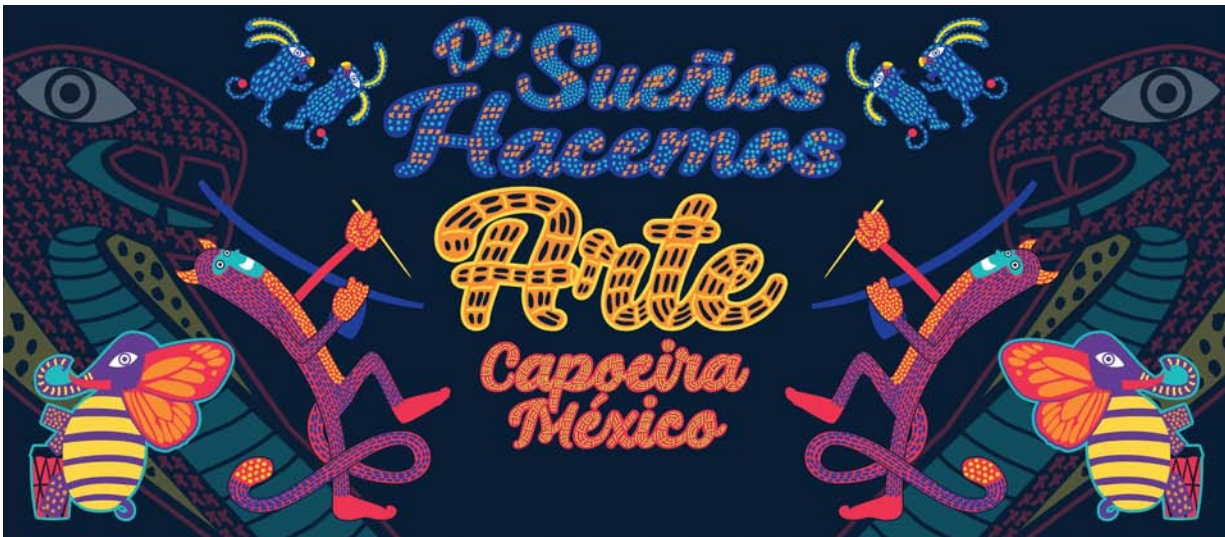
Figure 1: Banner with Mexican folk art motifs, taken from the website of the capoeira group Longe do Mar [ https://capoeira.org.mx/ ] on 10 July 2022.