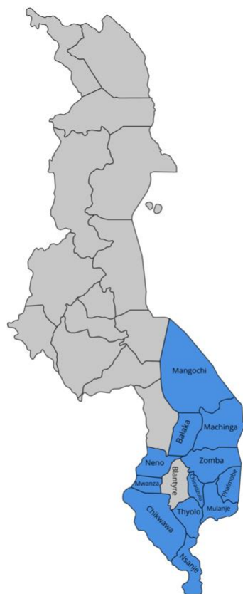
Figure 1: Map of Malawi depicting the Districts of the Southern Region included in the study (Blantyre not included in the sample as it does not have secondary level hospital facility and was therefore excluded)

From each hospital, we recruited 1 HAC chairperson, 1 GWS caretaker, 1 Hospital Management Committee member and six patient guardians for in-depth interviews (IDIs). Two focus group discussions (FGDs) were also conducted at each hospital (1 male; 1 female) to fully understand the opportunities and challenges surrounding GWSs. The study recruited patient guardians who had used the GWS for more than four days to ensure they were familiar with the hospital and GWS setting.